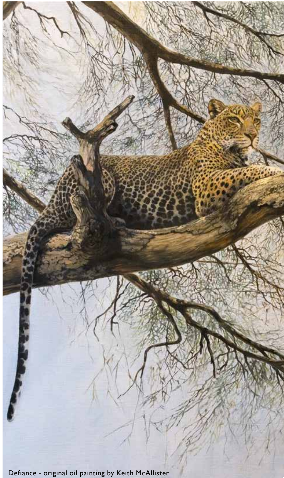
Defiance - original oil painting by Keith McAllister

in particular, they are a real pest when steady driving is required to get you and your team up a muddy embankment in another patch of forest. Butterflies would sometimes flutter away from the tyre track and the cool moist air would get a blast of diesel fumes as the Land Rover surged onward in low range up another embankment.