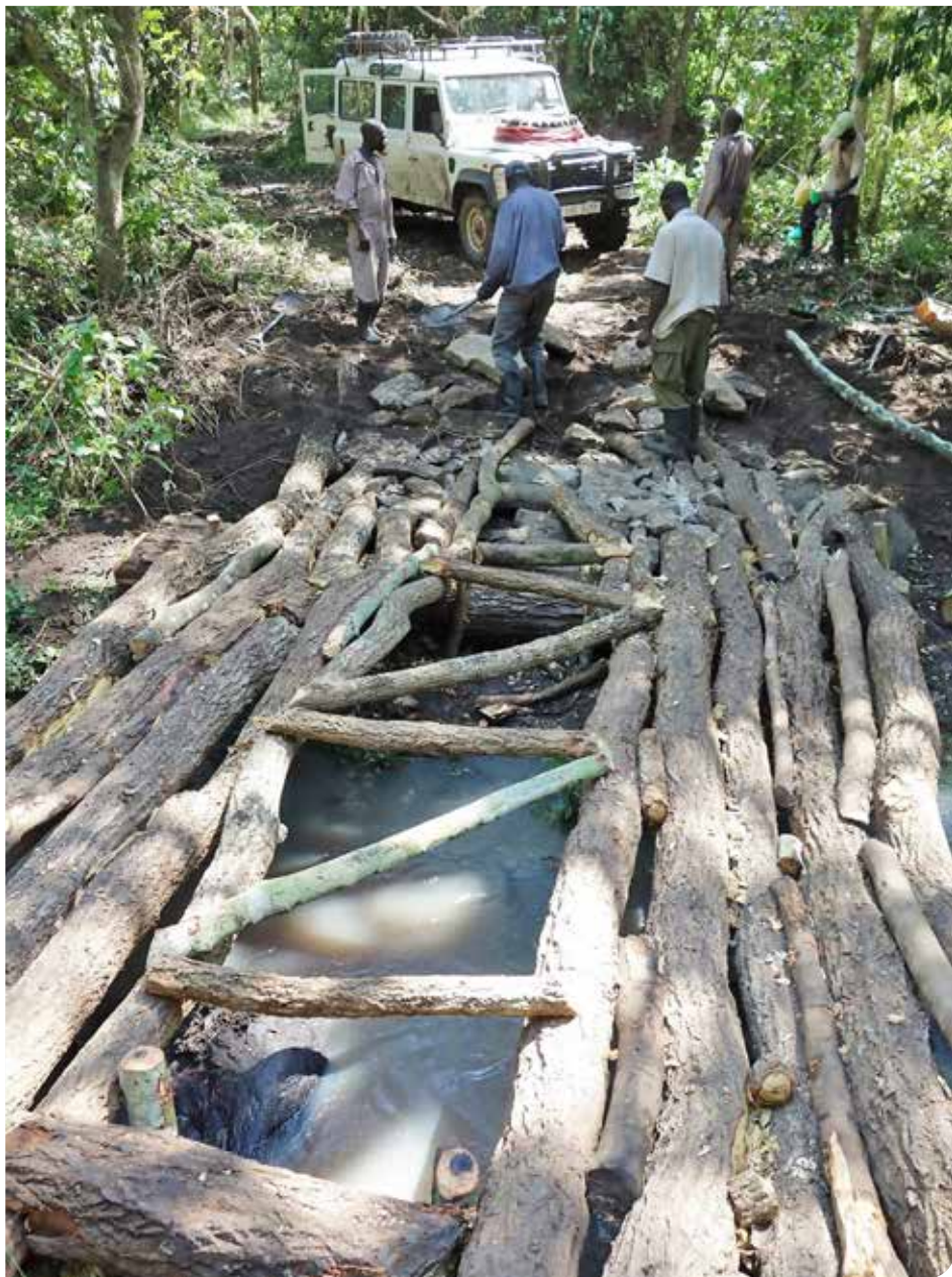
One of the bridges we built

If you find yourself sitting in a camp chair being eaten alive by mosquitoes and staring at the tops of your muddy boots somewhere along the White Nile with a rifle resting on your lap and a beer in your hand, and you are absolutely fatigued by a day of bridge building and road clearing, you may consider the possibility that you made some unusual choices in life. The stars are out and the rest of the camp has gone to bed but that feeling of melancholy has set in enough to start you thinking about all that life has now become or could become, and somehow the answer seems to rest in the flickering firelight.