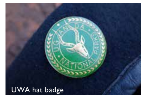
UWA hat badge

it from getting overly wet. We would pick up the pace on our journey home. Tired and waterlogged we would tramp in to camp and I would dry and clean the rifle and walk back out into the rain with a gin & tonic in hand, understanding that I could not possibly be any more soaked and that it was time for a drink.