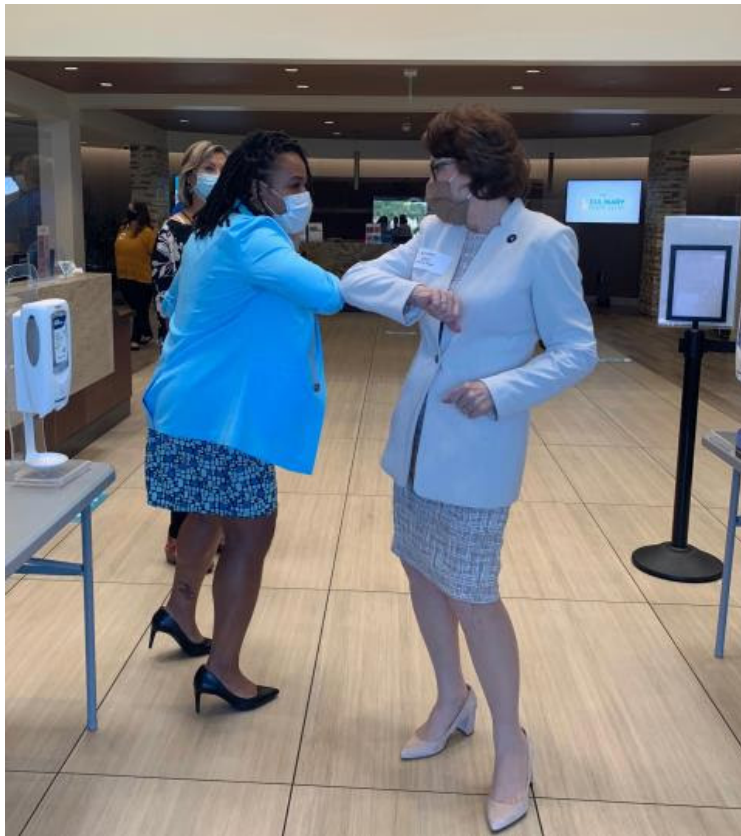
I toured the New York-New York Hotel & Casino and the T-Mobile Arena to learn more about how Congress can support the recovery of Nevada's travel and tourism industry.