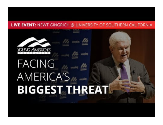
Facing America's at University of Sc