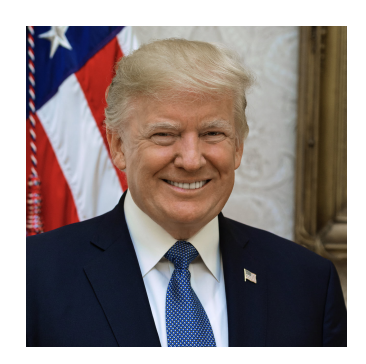
Donald J. Trump | The Whit

https://www.whitehouse.gov/about-the-white-house/presidents/donald-j-trump/