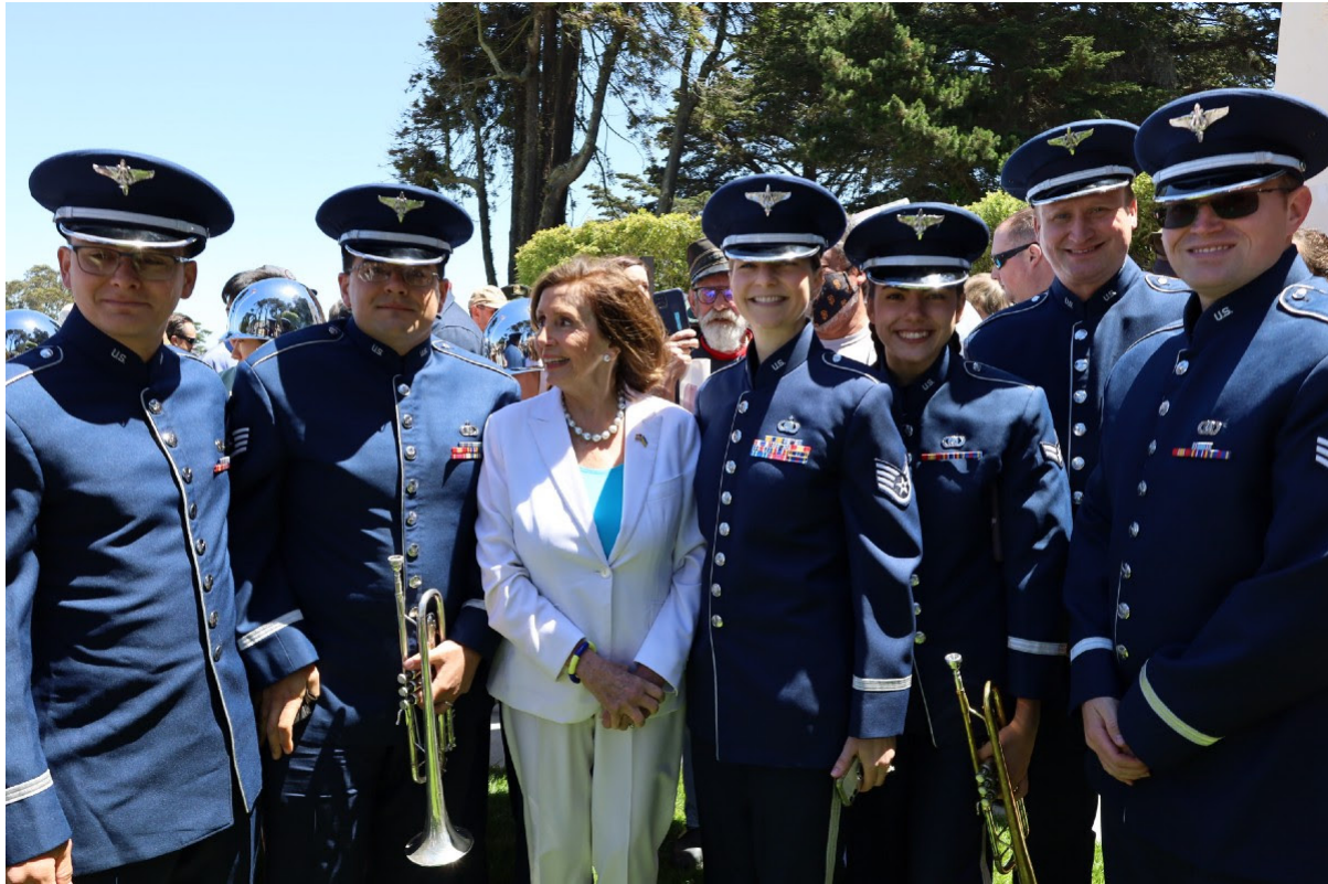
“Madam Speaker: A Behind-the-Scenes Look at the U.S. Speaker of the House”