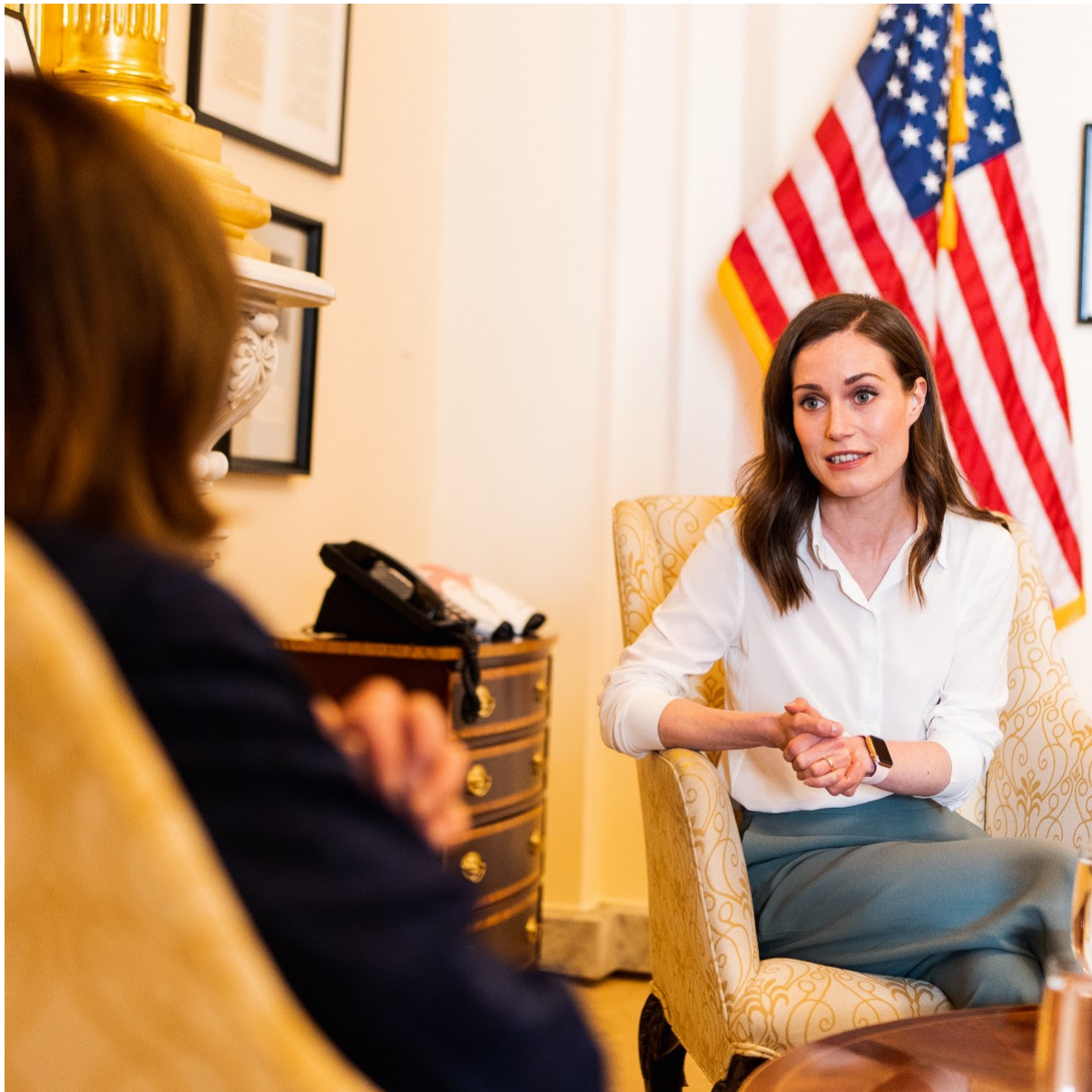
“Madam Speaker: A Behind-the-Scenes Look at the U.S. Speaker of the House”