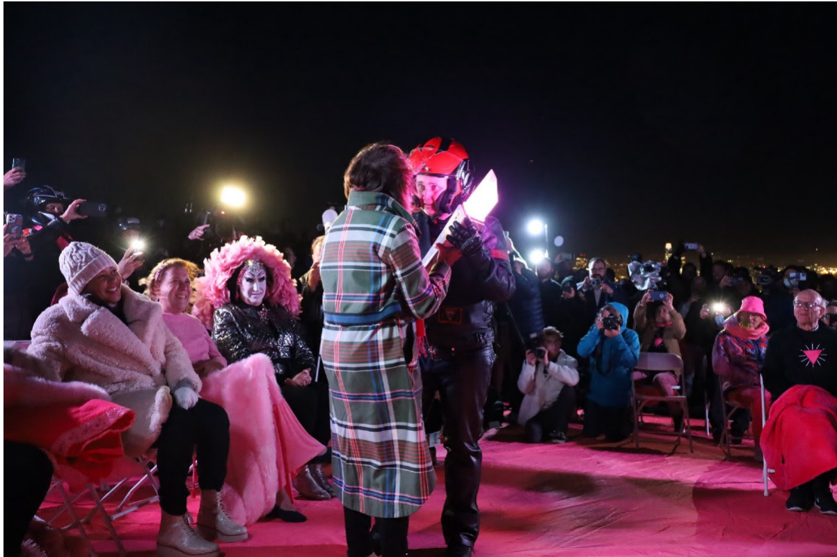
“Madam Speaker: A Behind-the-Scenes Look at the U.S. Speaker of the House”