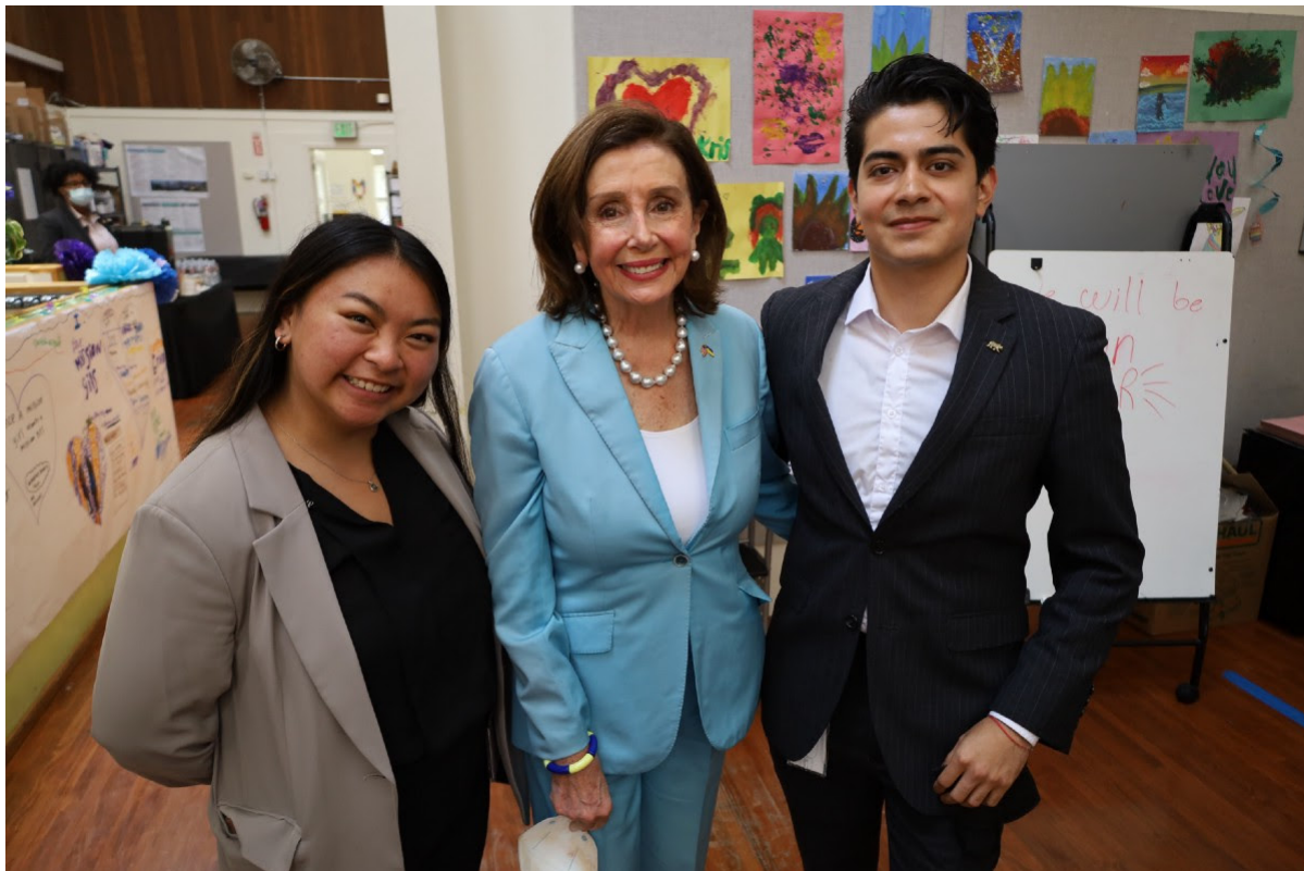
“Madam Speaker: A Behind-the-Scenes Look at the U.S. Speaker of the House”