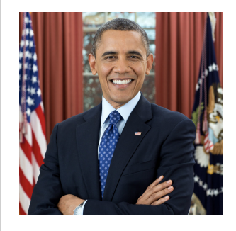
Barack Obama | The White House

https://www.whitehouse.gov/about-the-white-house/presidents/barack-obama/