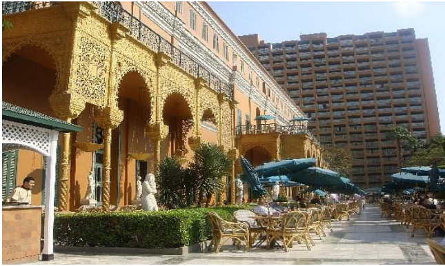
Cairo Marriott Hotel & Omar Khayyam Casino