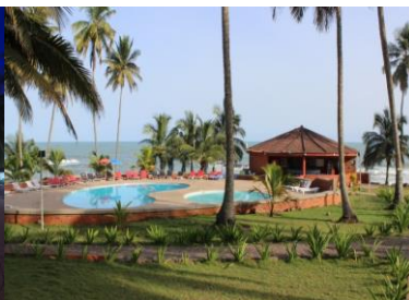
COCONUT GROVE BEACH RESORT