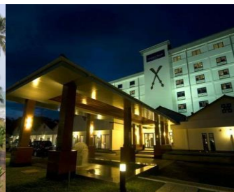
GOLDEN TULIP HOTEL