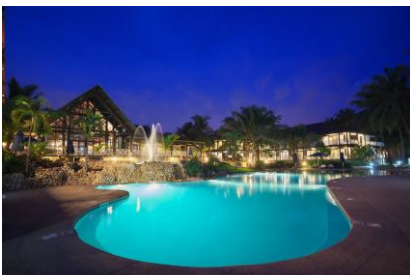
LABADI BEACH HOTEL

Royal Senchi Hotel - https://www.theroyalsenchi.com/