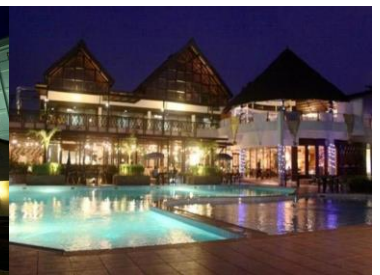
ROYAL SENCHI HOTEL