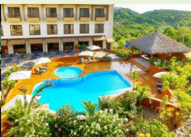
RIDGE ROYAL HOTEL