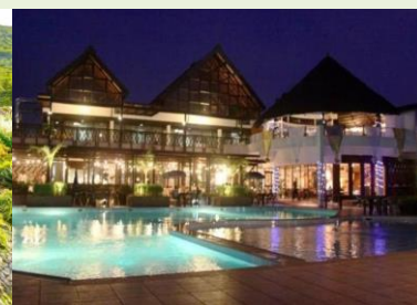
ROYAL SENCHI HOTEL