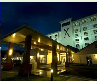
LANCASTER CITY HOTEL