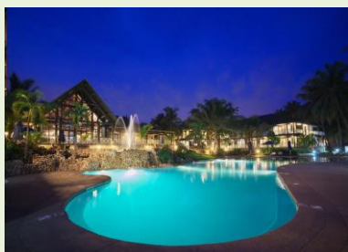
LABADI BEACH HOTEL

ROYAL SENCHI HOTEL - Https://Www.Theroyalsenchi.Com/