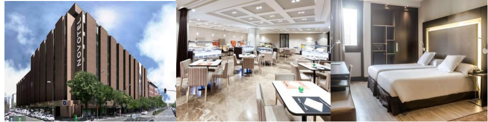
<<<<<<<<<<<Novotel Madrid Center>>>>>>>>>>>>