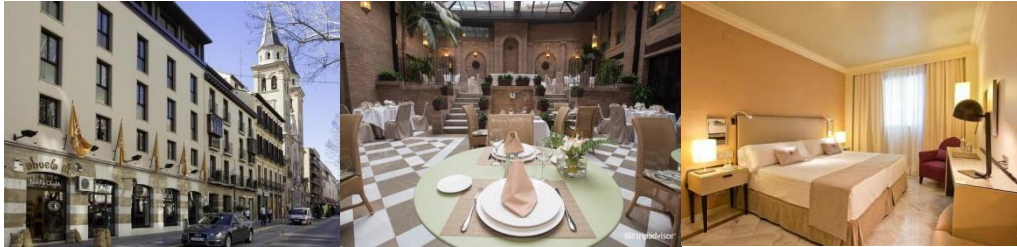
<<<<<<<<<<<Granada Vincci Albayzín Hotel>>>>>>>>>>>>