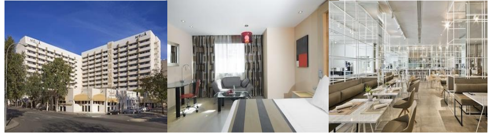
<<<<<<<<<<<Melia Sevilla Hotel>>>>>>>>>>>>