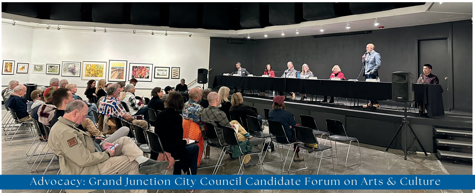
Advocacy: Grand Junction City Council Candidate Forum on Arts & Culture

We strive to promote and collaborate in the development of the creative economy; cultivate and gather creative, financial, and intellectual resources in order to strengthen collaboration among all creative entities in the Valley; and elevate the quality of creative expression for all, enriching lives throughout the region.