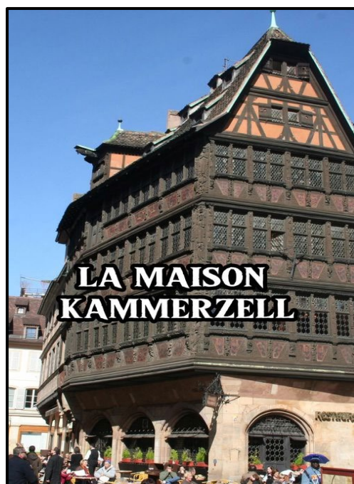
Restaurant at Maison Kammerzell. Gothic Architecture, built in 1427