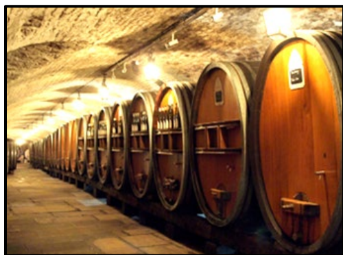
Historic Wine Cellar - Strasbourg Hospices.

Please note: seating is limited. Tickets (USD $75) must be pre-purchased https://vdw.swoogo.com/VDW2026