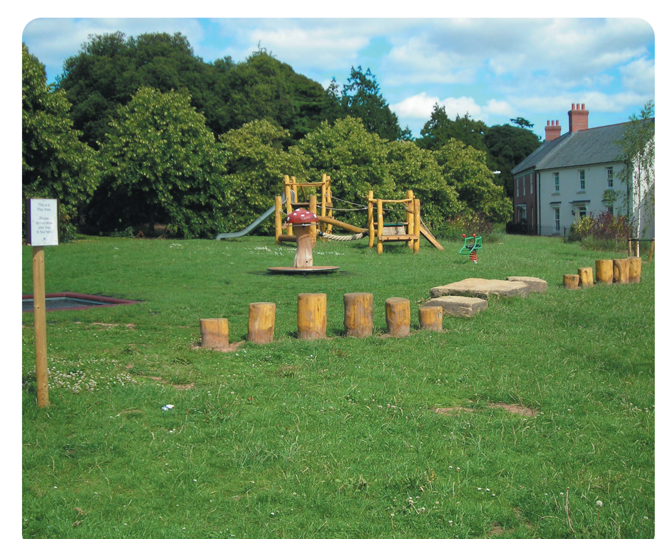
A range of play spaces