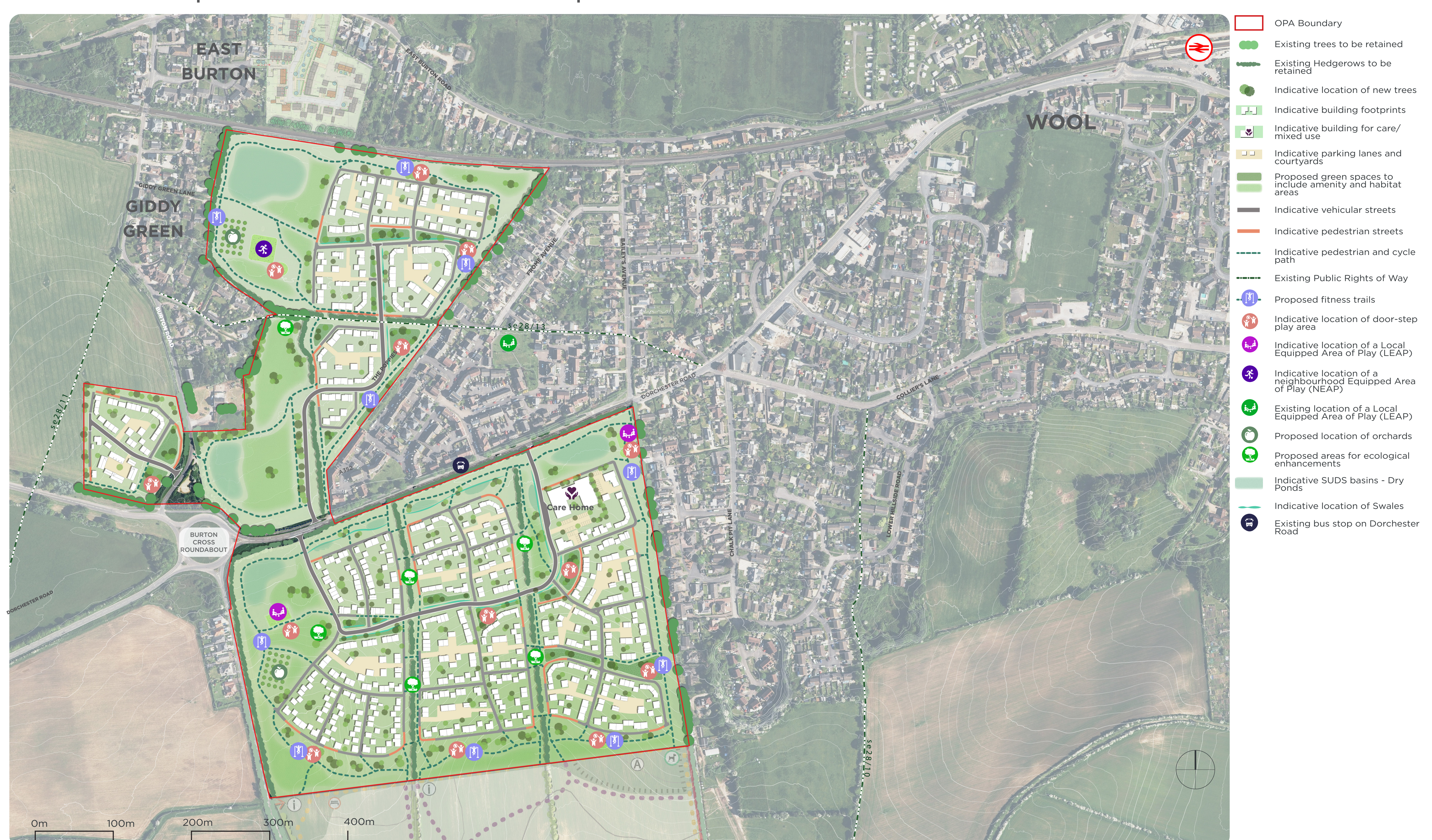
Illustrative masterplan - New homes set within landscape