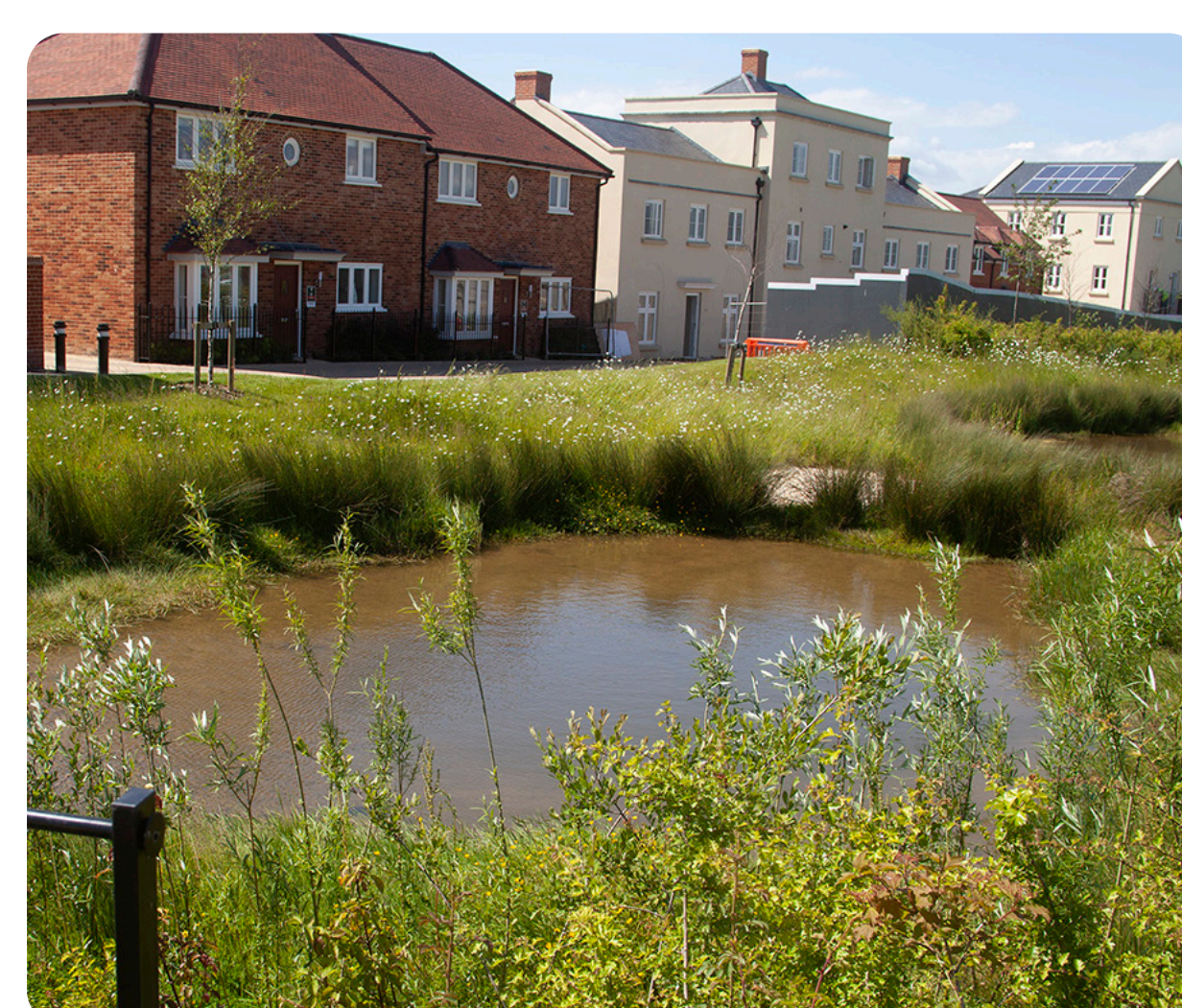
New homes / sustainable drainage