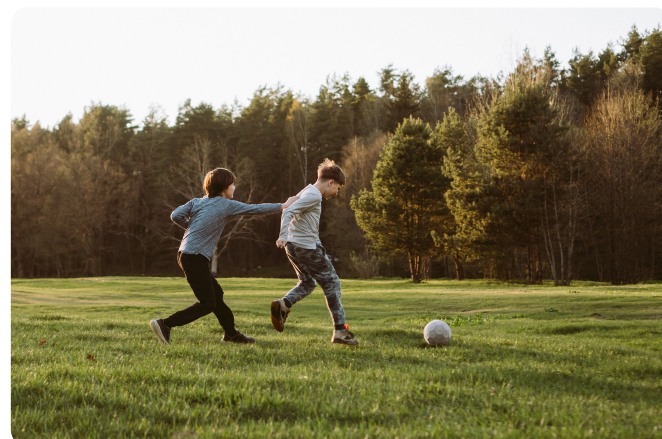
Informal doorstep play areas within the development