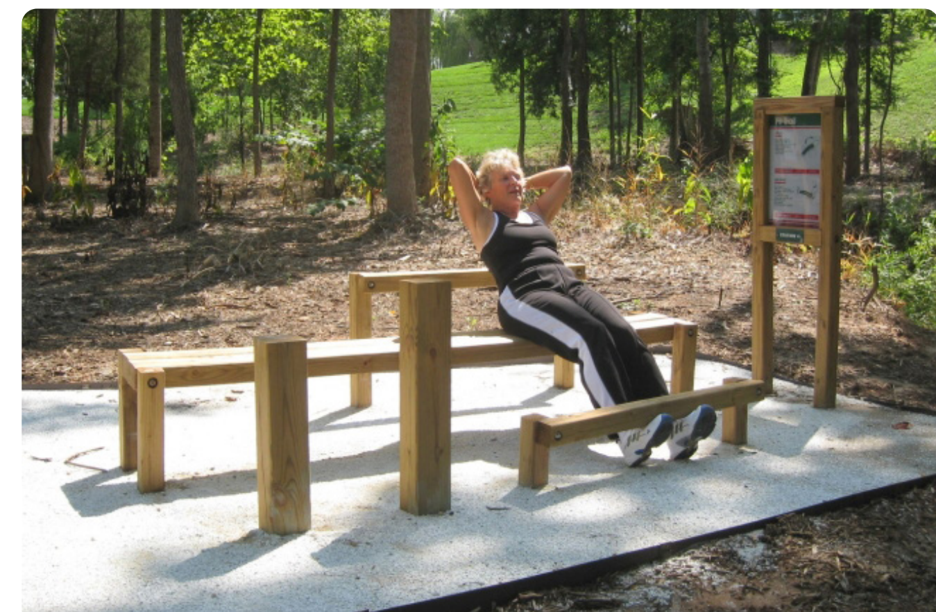
Trim trail to encourage healthy lifestyle