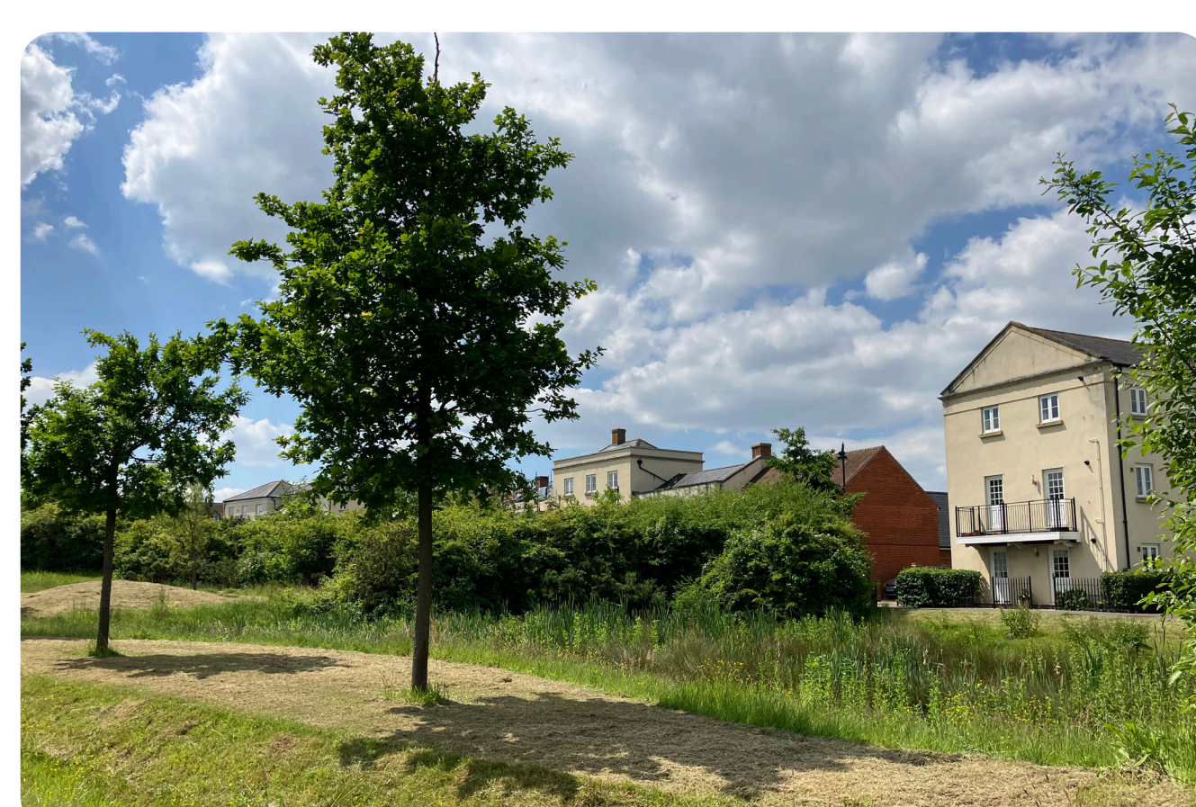
Planting used to create attractive and vibrant streetscape