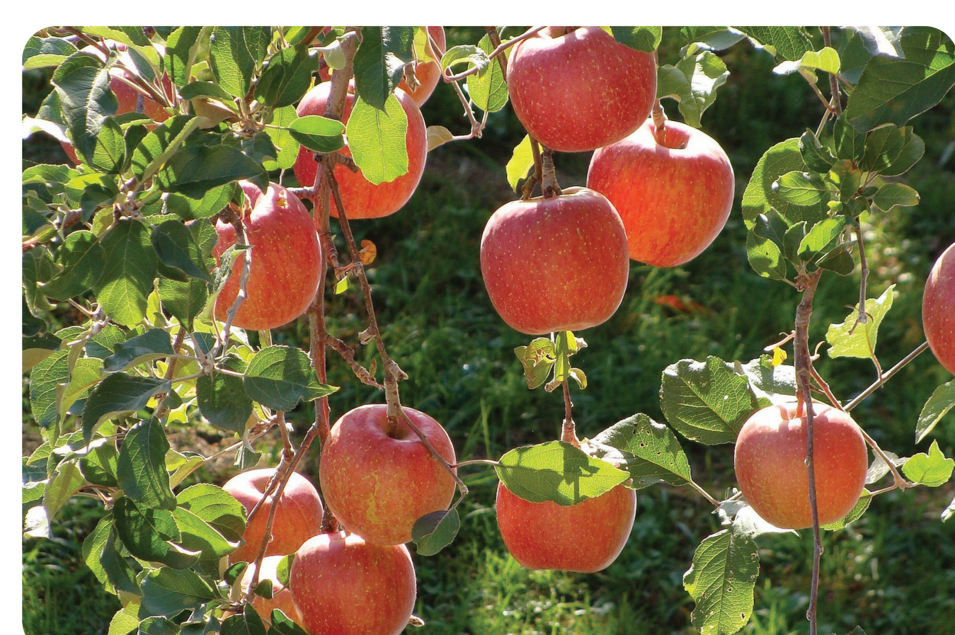
Opportunities for local food growing and orchards