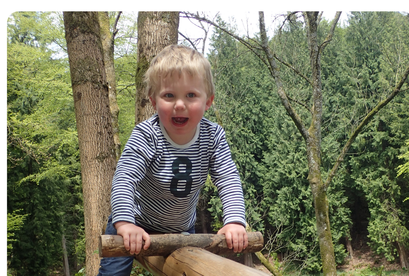
A wide range of play spaces throughout the development