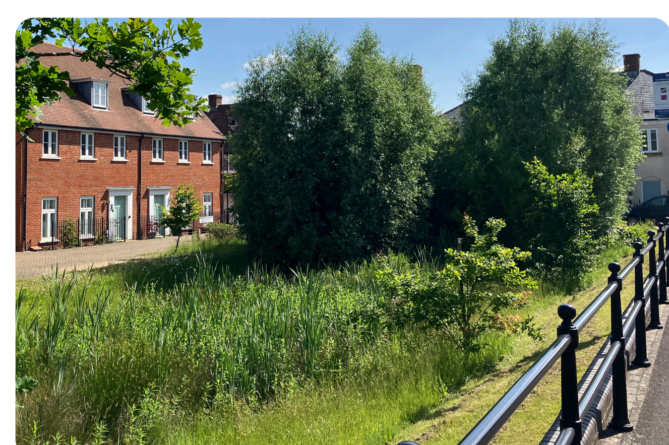
Sustainable drainage features with new planting