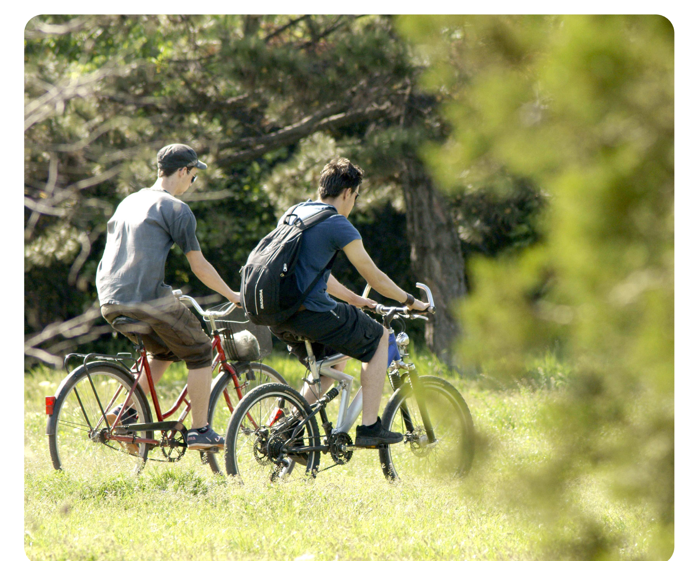
Integrated walking and cycling infrastructure