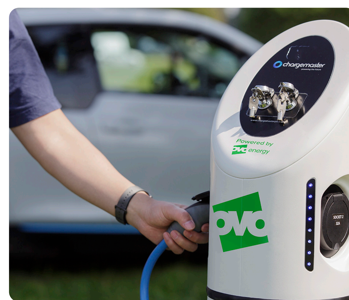
EV charging on plots and streets