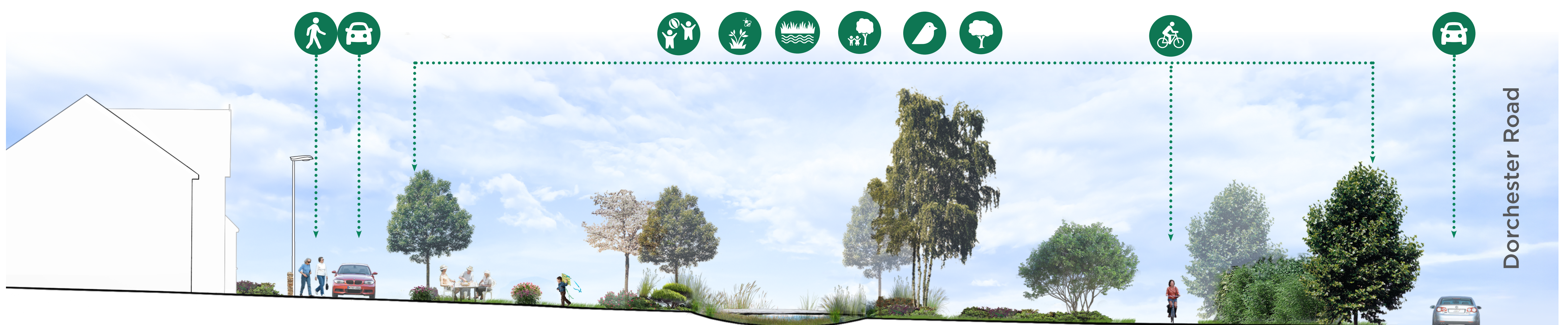
Idea for the new space south of Dorchester Road, with proposed sustainable drainage features and footpath - cycle way.