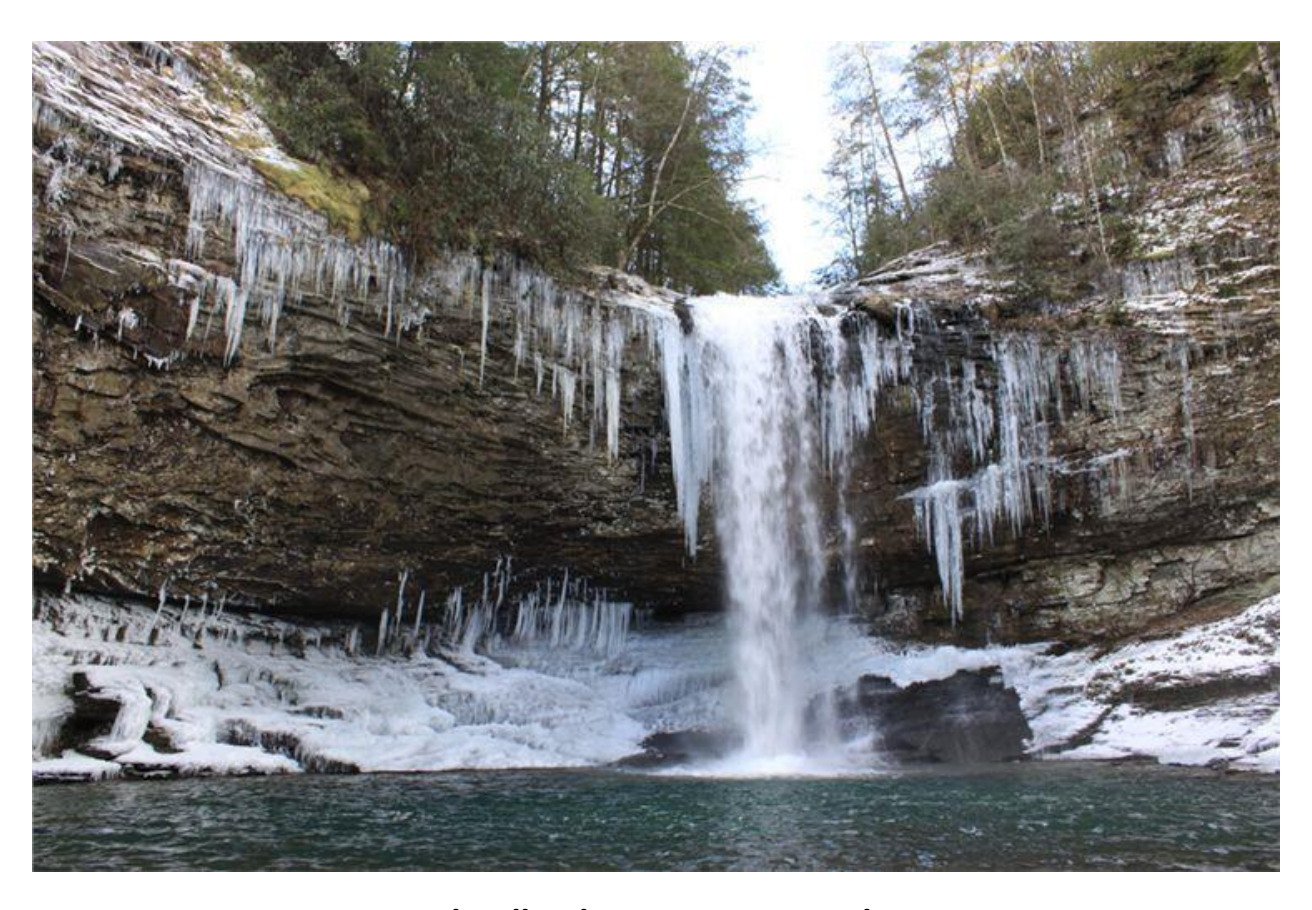
Cloudland Canyon State Park View from the West Rim Trail Rising Fawn, Georgia