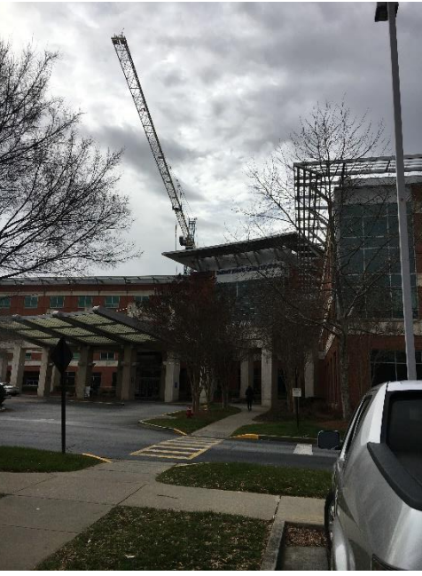
Cranes Setting Beams January 10, 2020