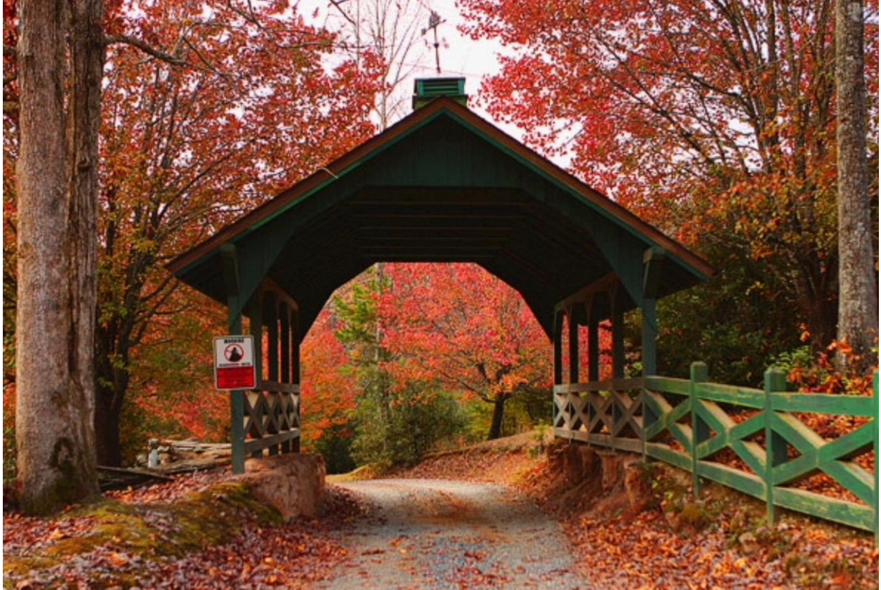
The Old Bridge, Blue Ridge GA