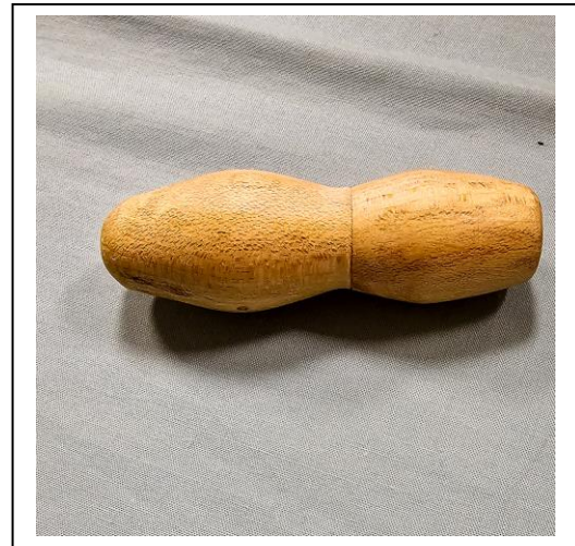
2 nd Alison Bissby

Only 2 beginner entries this month, hoping for more next month.