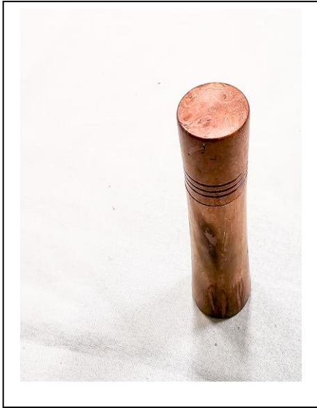
1 st Gary Atkins