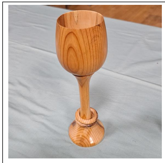
3 rd Tim Pettigrew