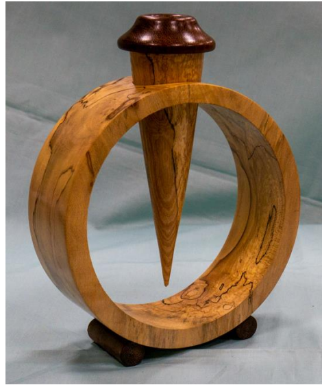
1 st Tony Buttle