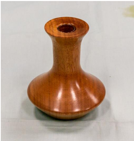
2 nd Phil Walters