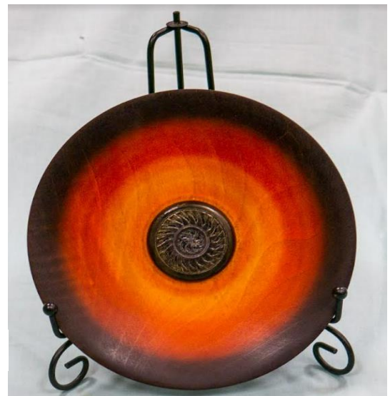
3 rd = Brian Stanton