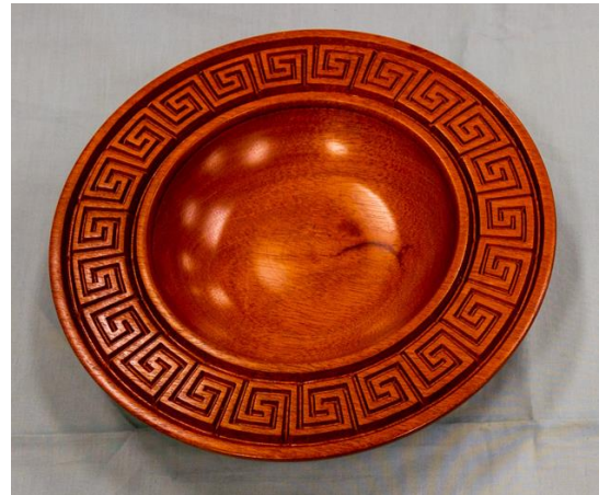
3 rd = Allen Kaye)