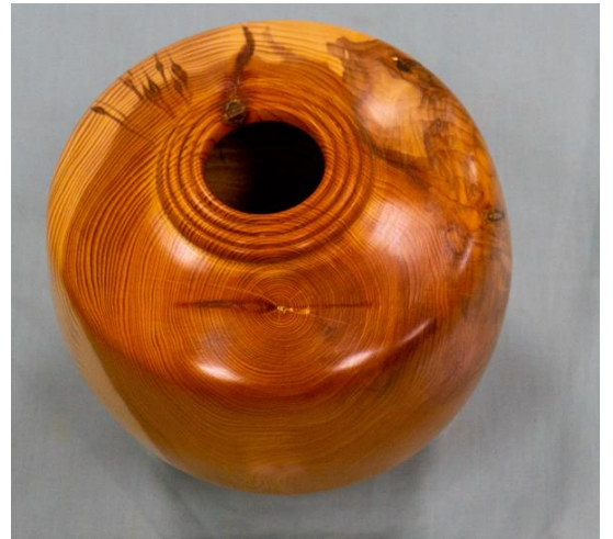
1 st = Phil Scoltock