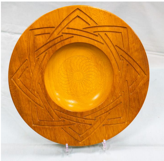
3 rd = Phil Scoltock