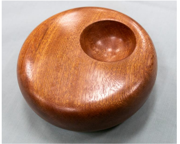
1 st Pete Pocock