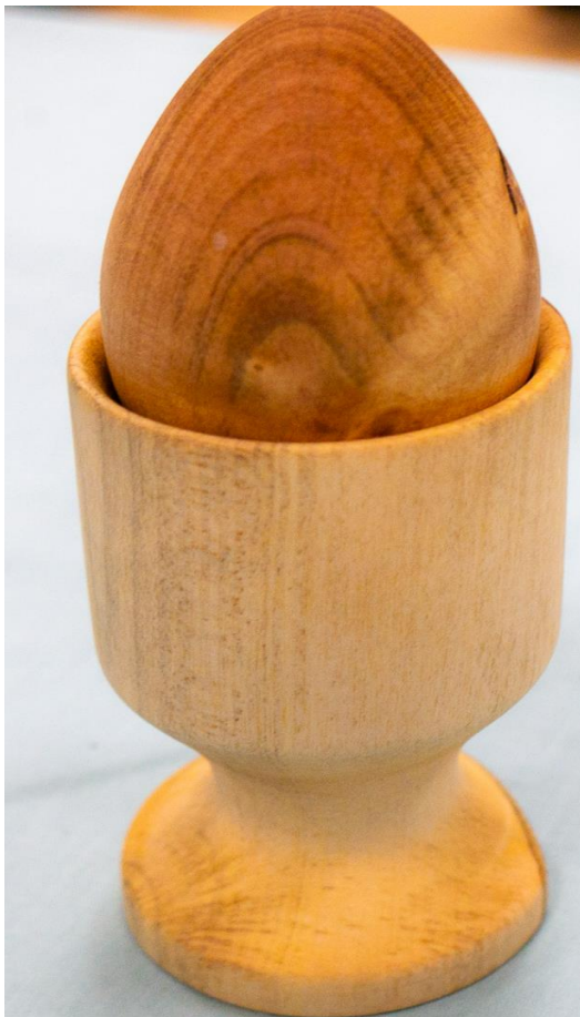
2 nd James Blackie