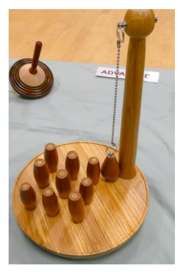
2<sup>nd</sup> Phil Walters