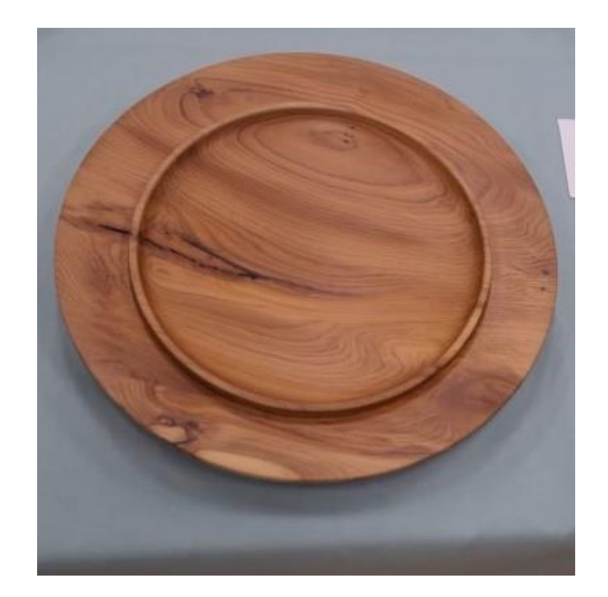
1<sup>st</sup> Place – Peter Hoare