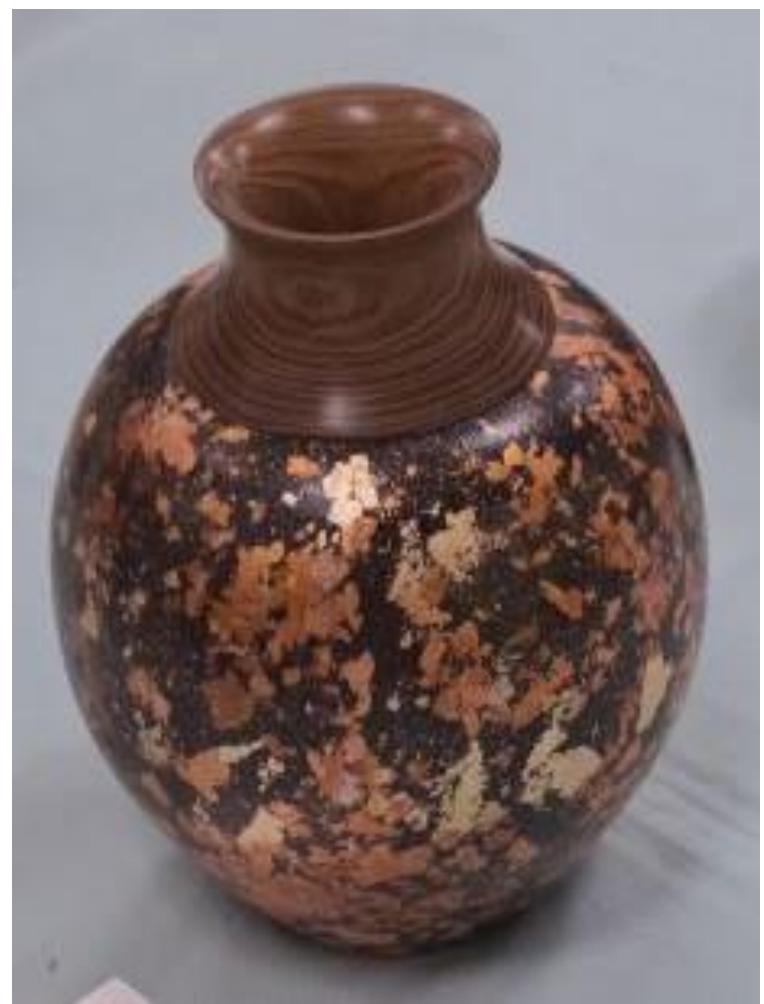
2<sup>nd</sup> Place – Grahame Tomkins