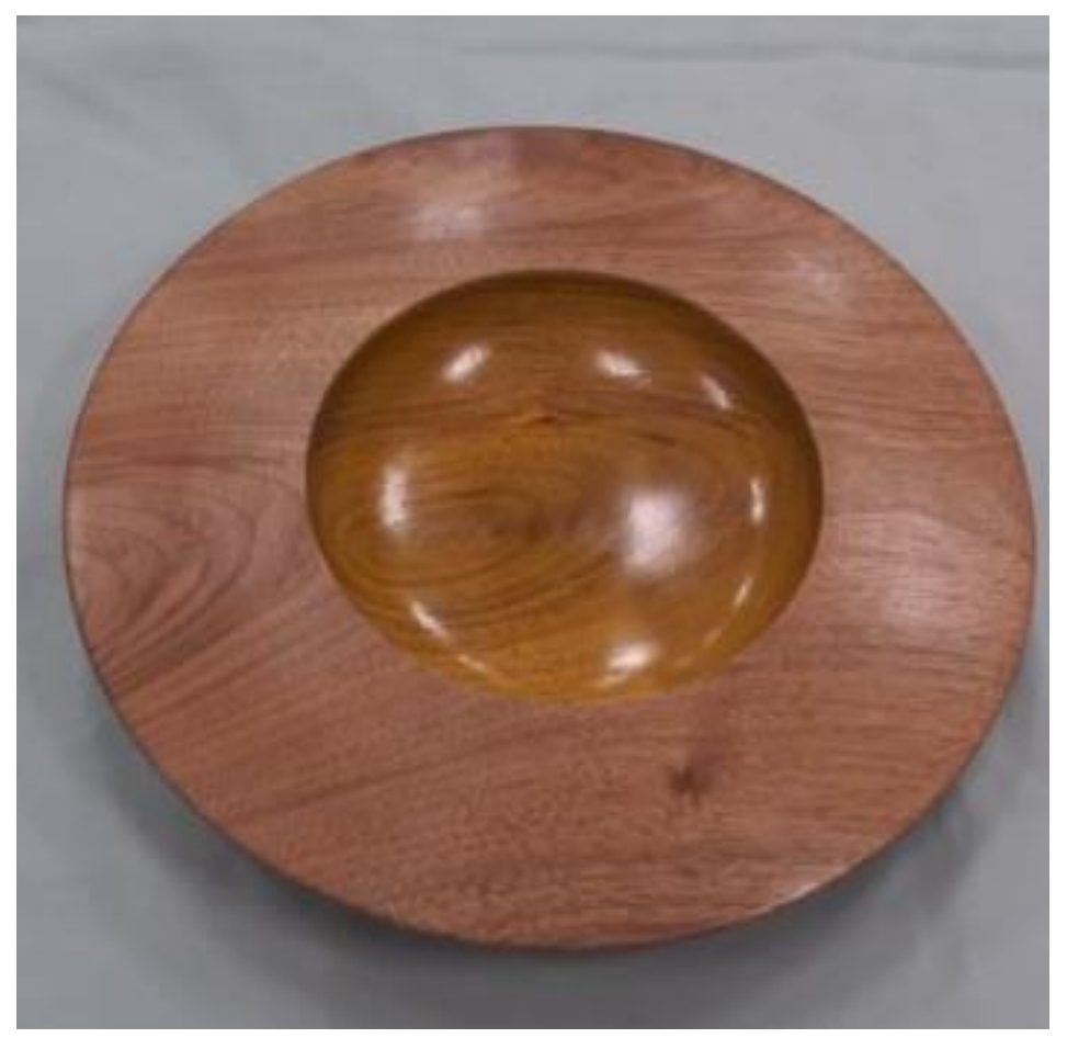
2<sup>nd</sup>= Place – Alan Lewis