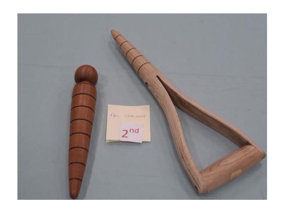
2nd Place - Phil Walters