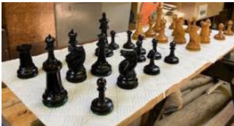
full set with finished ones at front