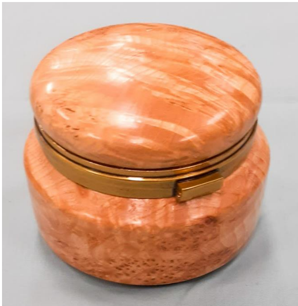
3 rd Phil Walters