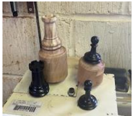
both finished and one stained