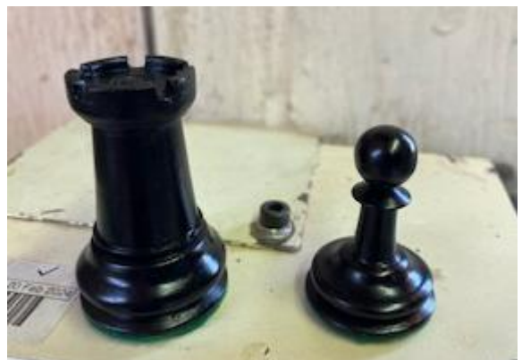
the two new pieces