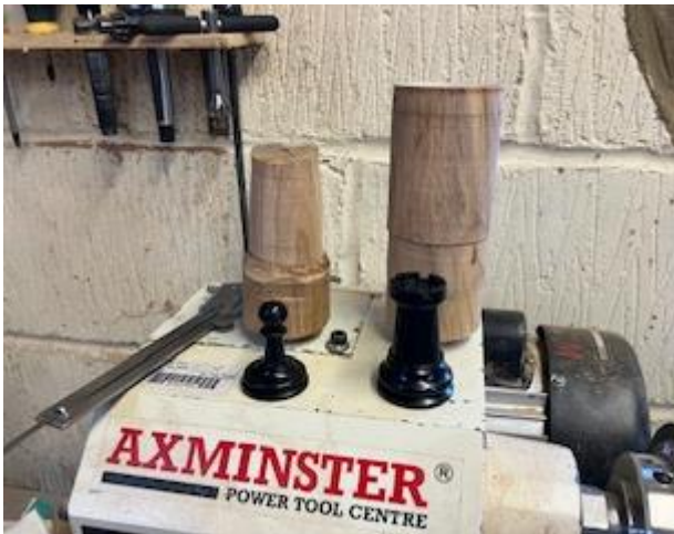
The pieces to be replaced with yew blanks behind

I said I would contact him and have a go. Here are the pictures. Turns out that the set is probably Bakelite not wood, but I managed to stain some yew, reproduce the pawn, and replace a castle which was from another set. All pieces now finished with a melamine varnish and the two new pieces weighted with lead to match.