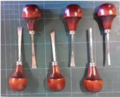
Ramelson (USA) Palm Carving Tools