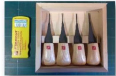
Flexcut Micro Palm Carving Tools supplied with plasters! That's forward planning.

With this style of handle a mallet can be used, if required