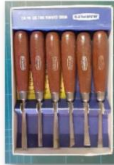
Marples No. 153 Carving Tools.

With this style of handle a mallet can be used, if required