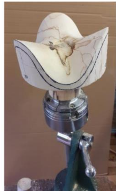
Carver's Vice – Provides 3 dimensional adjustment. Supplied with mounting plate and chuck attachment