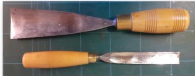
Individually bought tools – Alongee style 2in (50mm) no. 6 sweep and a ¾in (19mm) no. 5 sweep (both “London Pattern”)