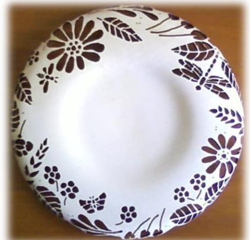
Example - Sycamore plate, turned and pierced in the style of Jennie Starbuck

A Carver's Vice is also very useful as it provides 3 dimensional adjustment.