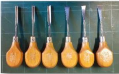
Footprint No.36 Palm Carving Tools