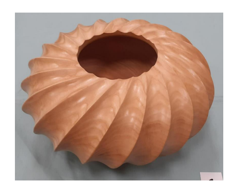
1<sup>st</sup> Phil Scoltock