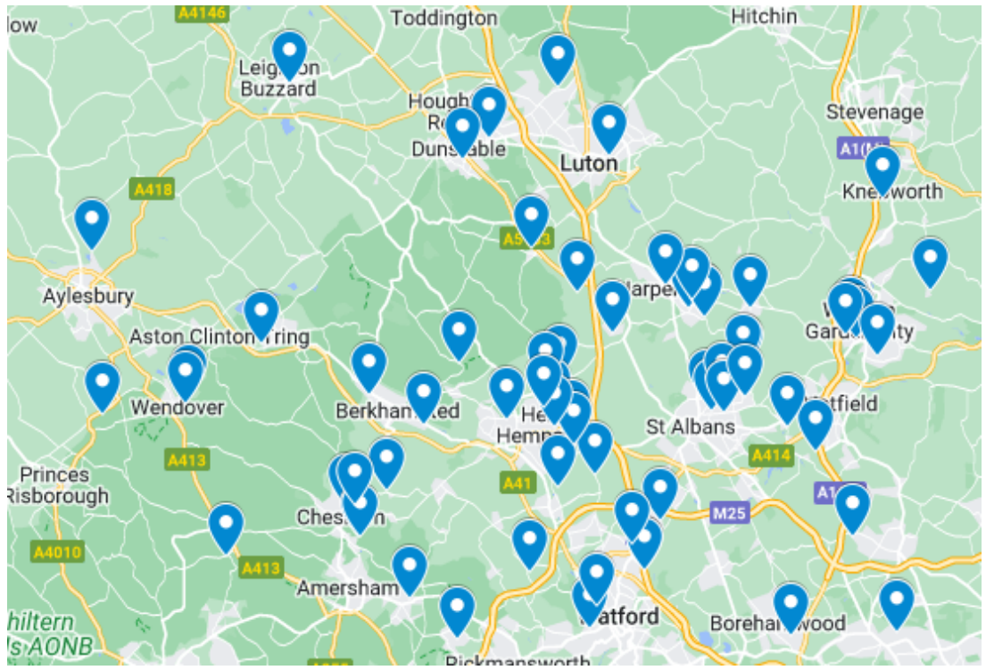
Our Club Members Locations

This map shows the possibilities from the wide spread of member locations.