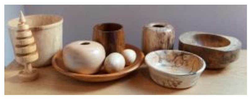
HOW YOU CAN HELP

I will be asking the punters for a contribution to club funds.