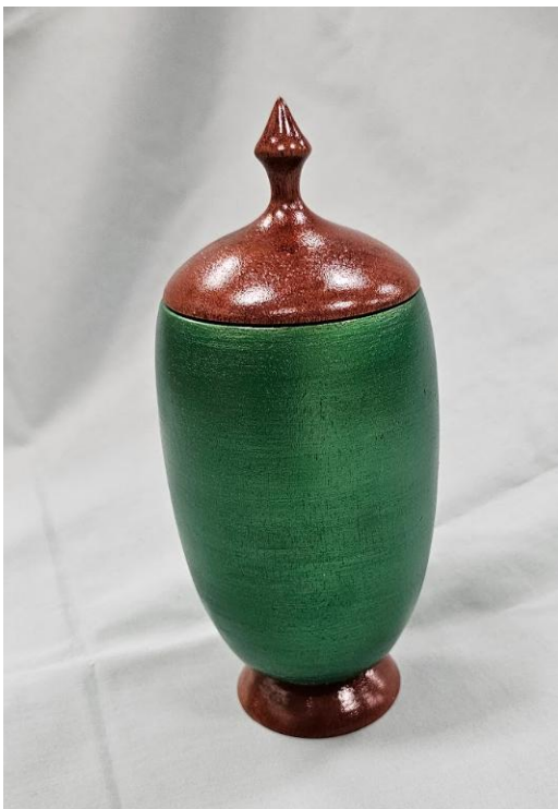
3 rd = Peter Pocock