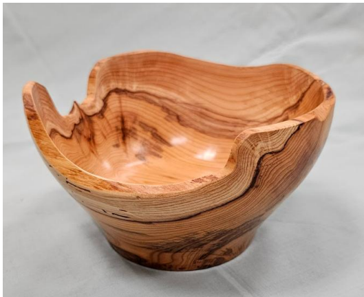
3 rd = Tony Buttle