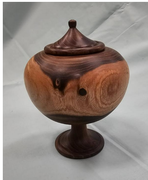
3 rd = Adam Blackie