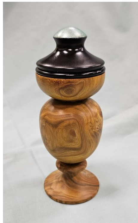
3 rd = James Blackie