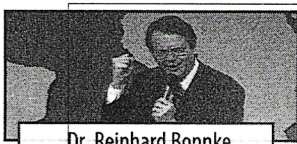
Dr. Reinhard Bonnke