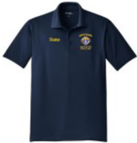
Sport-Tek Adult Micropique Sport-Wick ® Polo