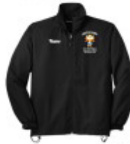
Sport-Tek Full-Zip Wind Jacket