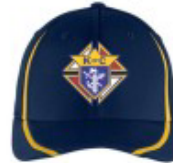
Sport-Tek ® Flexfit ® Performance Colorblock Cap