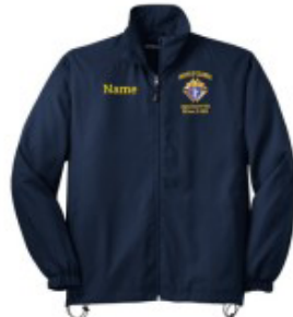
Sport-Tek ® Full-Zip Wind Jacket