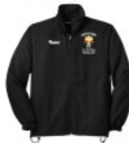
Sport-Tek Full-Zip Wind Jacket