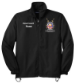
Sport-Tek Full-Zip Wind Jacket