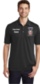
Port Authority Dry Zone Uv Micro-Mesh Tipped Polo