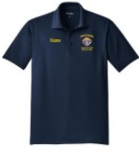
Sport-Tek Adult Micropique Sport-Wick ® Polo