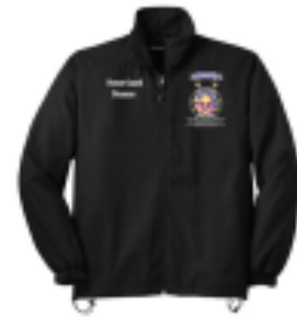
Sport-Tek Full-Zip Wind Jacket