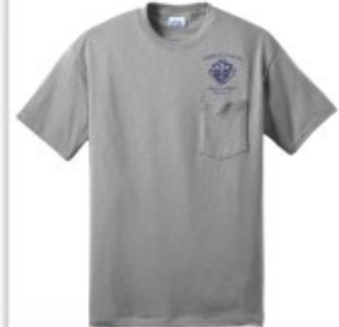
Port & Company Core Blend Pocket Tee