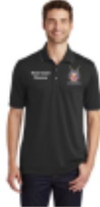
Port Authority Dry Zone Uv Micro-Mesh Tipped Polo