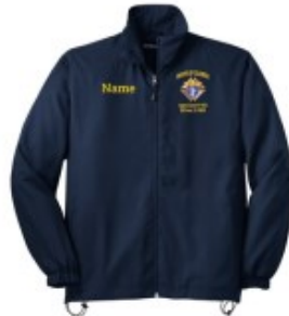
Sport-Tek ® Full-Zip Wind Jacket