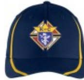
Sport-Tek ® Flexfit ® Performance Colorblock Cap