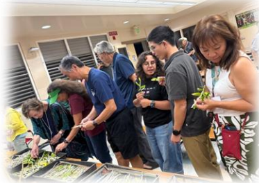
Members chose between small, medium, and large Honohono canes.