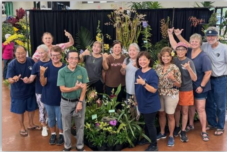
The traditional volunteer's photo in front of the display.

Our next orchid show is just around the corner, and we're excited to participate! To create a beautiful and successful display, we'll need your support. We need your show quality blooming orchids, supporting non-orchid plants to fill the spaces between orchids and your help to set up and take down the display. The show theme is " Orchids: Ma'uka to Ma'kai. " If you're able to help in any way, please contact our KOS show display chairperson, Suzanne Yamada, at (808) 206-4758 to be added to the volunteer list. Your help would be greatly appreciated.