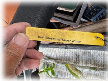
This is how the canes should look like on 2 weeks. The name tag has the Honohono canes that you received.