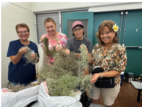
Our lovely ladies getting the "hinahina" ready for our display.

Conclusion & Breakdown: June 7, (Saturday) at 4:00 pm.