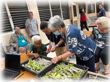
Members selecting Honohono canes to take home and sprout keiki.