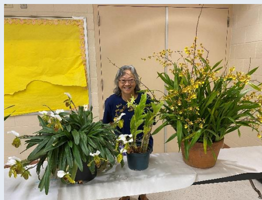
Paph. Leeanum Karen Yamamoto