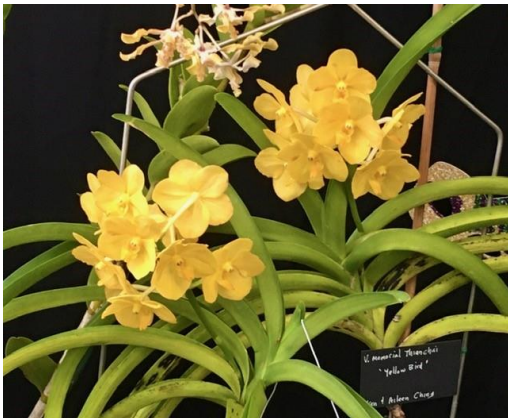
Best Yellow Vanda – V. Memorial Thianchai ‘Yellow Bird’