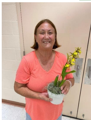
Brassidium Hybrid Dale Mahi