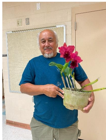
Cattleya Hybrid Max Nonies