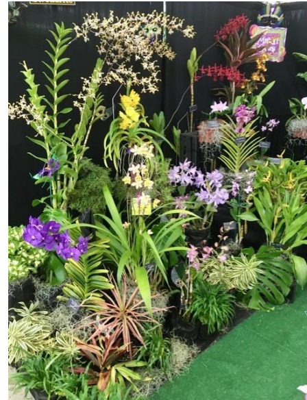
Ferreira's seven foot dendrobium

“Mardi Gras” means Fat Tuesday in French because rich and fatty foods are traditionally eaten before a period of austerity. So delicious food was an essential part in the set-up of our display too. Suzanne Yamada prepared a tasty spread with homemade banana bread, a big pot of chili, and chilled pineapple wedges which nicely paired with Aileen Ching’s hot dogs, rice, and tossed green salad.