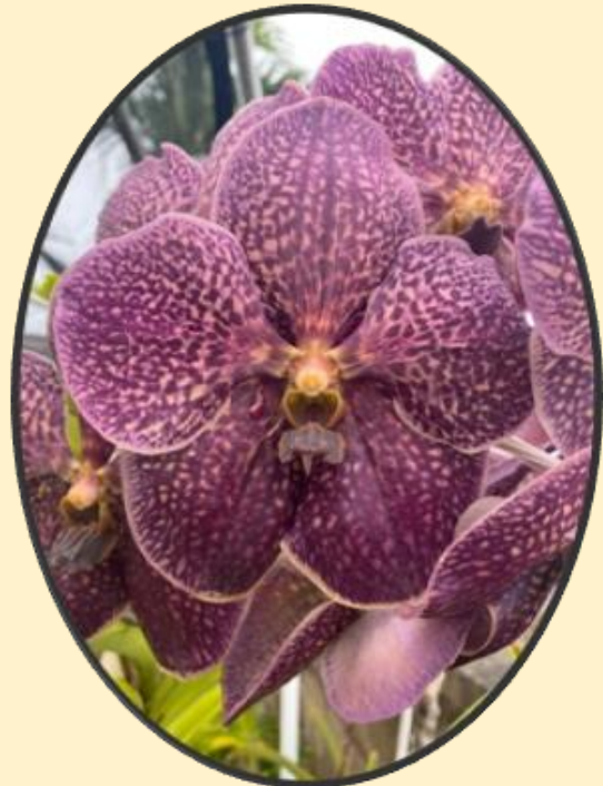
V. Fuchs Delight 'Black' Leland Nakai