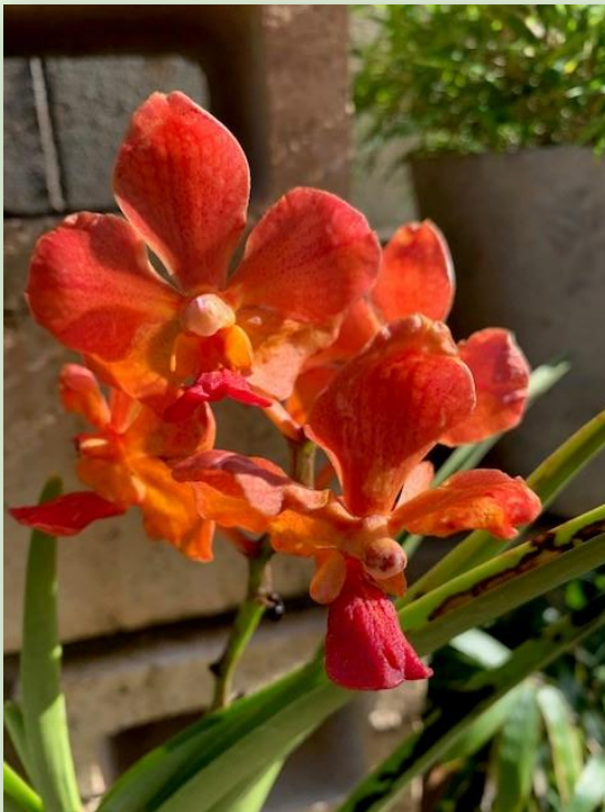
Vanda semi-terete.