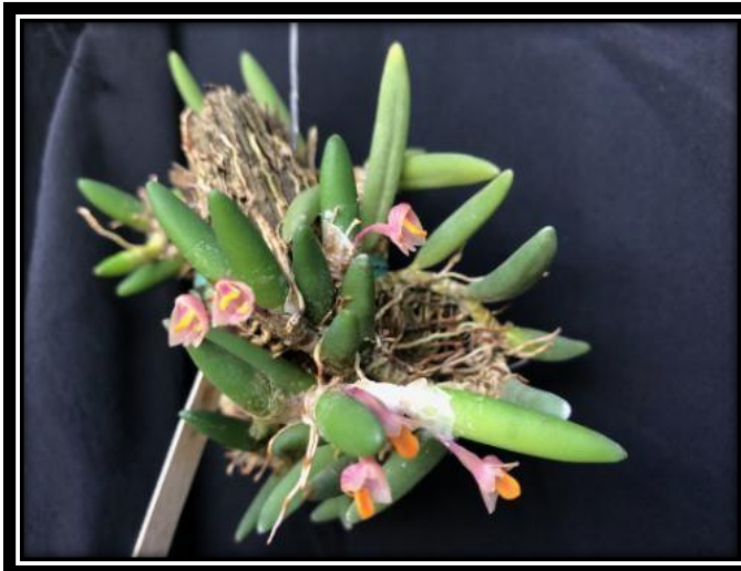
Den. lichenastrum from Australia

Plants that do better with more light can be placed higher up while those that like shade can be lower on racks or tables. Hanging plants can be hung on each other but avoid crowding plants.