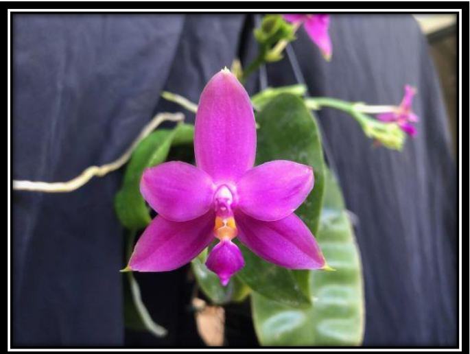
Cleisostoma williamsonii from SE Asia

I have a section of my covered patio set aside for my mini orchids which hang from an open wire rectangular garden box. Since most plants are small, I can have 30+ plants in layers and easily pull them out for care or inspection. The outer facing plants do get more sun.