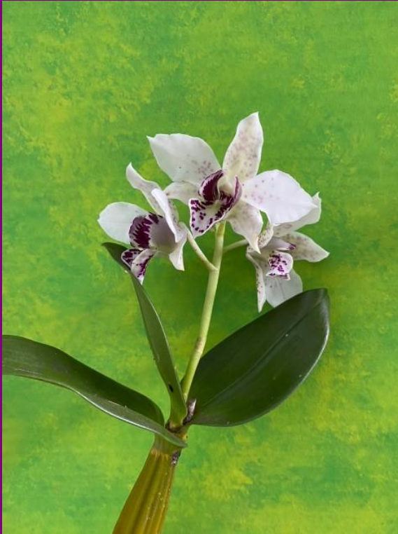
DENDROBIUM ROY TOKUNAGA 'WHIKNIGHT' DALEMAHI