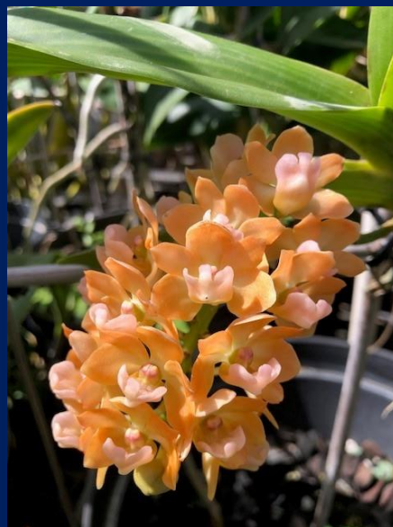
RHY GIGANTEA ALBA X PEACH - AILEEN & KEN CHING