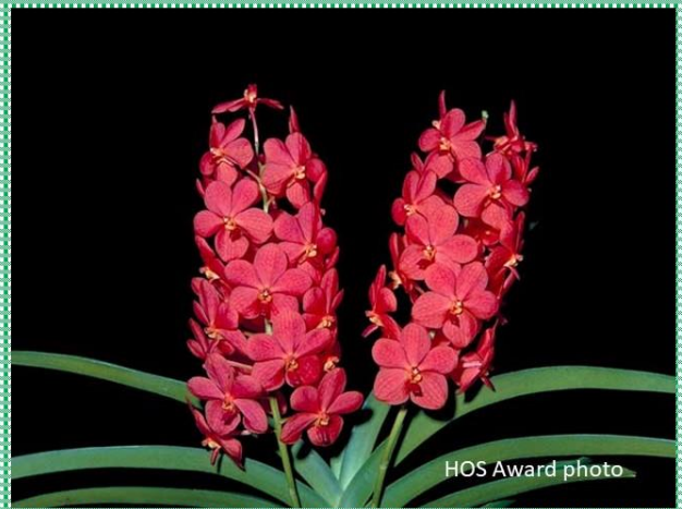
HOS Award photo

Dendrobium aggregatum 'Masa' CCM HOS 83 points 2010 Kunia Show 540 flowers & 34 buds on 24 inflorescence