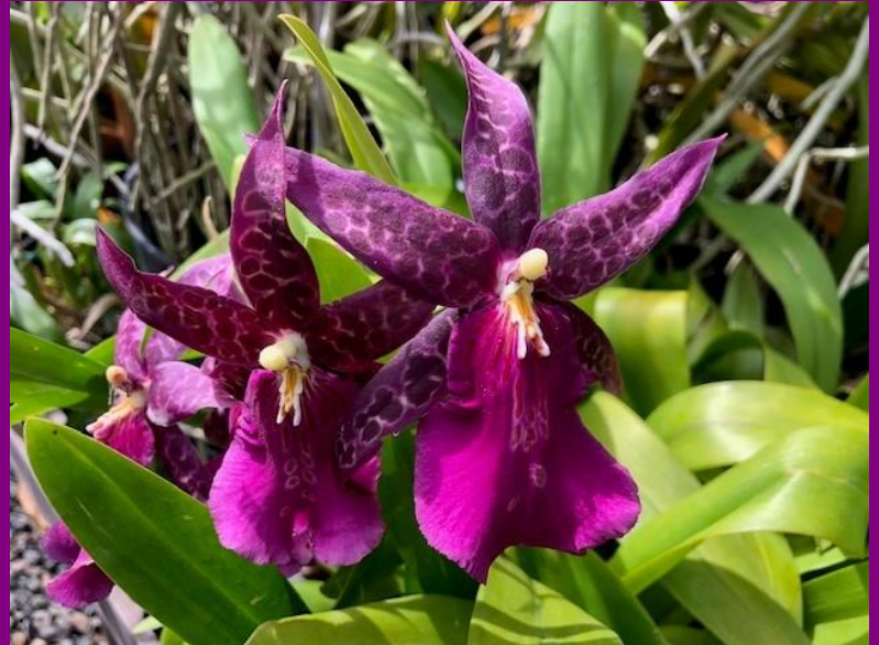
MTSA. DARK STAR 'THE ORCHIDWORKS' AILEEN & KEN CHING

JOIN US IN SHARING PICTURES OF YOUR BEAUTIFUL BLOOMS WITH YOUR KOS FAMILY. IT'S EASY. USE YOUR CELL PHONE OR A CAMERA TO CAPTURE YOUR FLOWERS. SEND THEM ANYTIME TO DENISE STEWART AT DENITYLER@SBCGLOBAL.NET WITH YOUR NAME AND PLANT DESCRIPTION. YOU CAN ALSO BE ANONYMOUS IF YOU LIKE.