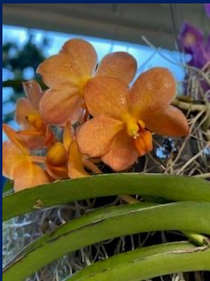
ASCDASUN-FUN BEAUTY 'ORANGE BELLE' AM.AOS JOCELYN MOKULEHUA