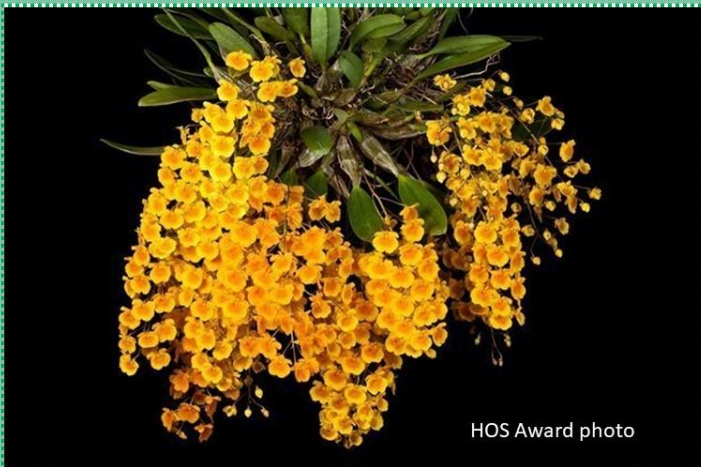
HOS Award photo

Dendrobium aggregatum 'Masa' CCM HOS 83 points 2010 Kunia Show 540 flowers & 34 buds on 24 inflorescence