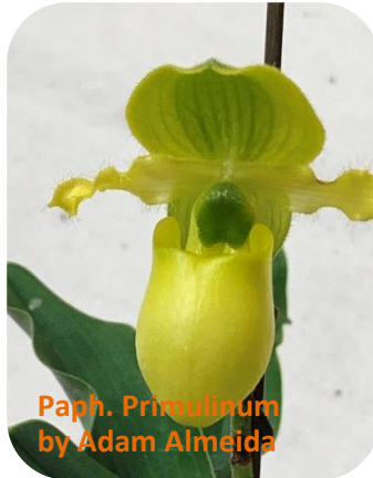
Paph. Primulinum