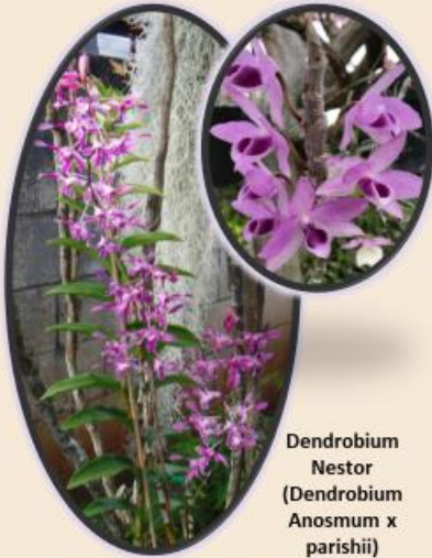
Dendrobium Nestor (Dendrobium Anosmum x parishii)