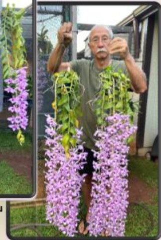
Den. Touch of Class

Vanda Cherry Blossum (Neof. falcata x Asctm. ampullaceum)