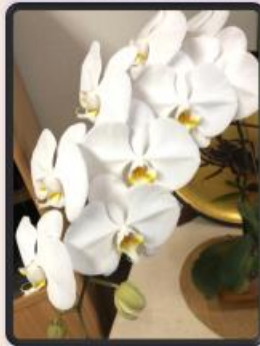
Phal. Sogo Yukidian