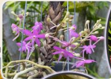
Den. Ueang Phueng (Den. jenkinsii x lindleyi)

Vanda Cherry Blossum (Neof. falcata x Asctm. ampullaceum)