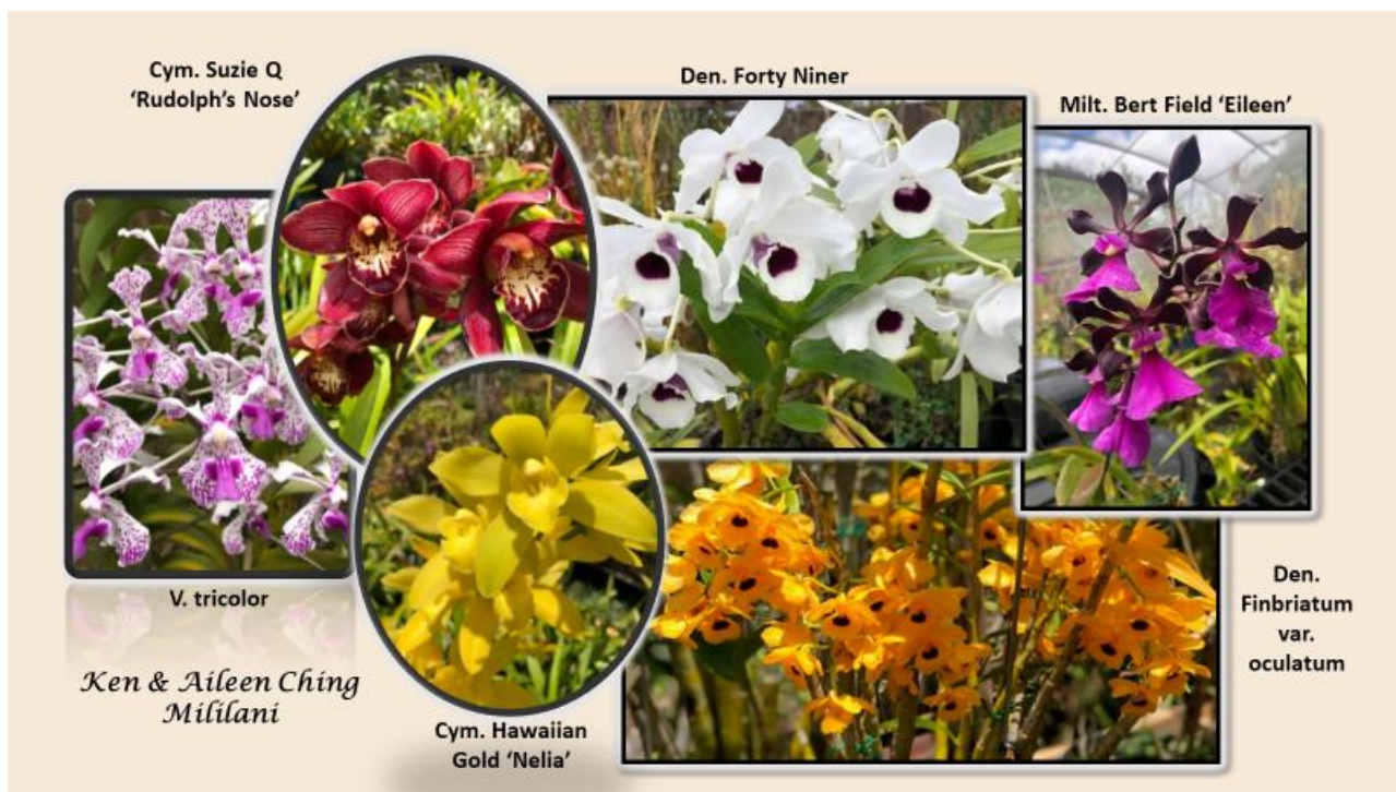
Cym. Suzie Q 'Rudolph's Nose'