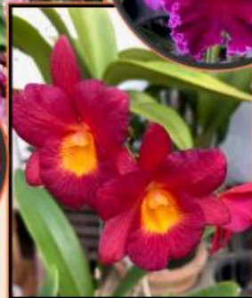
Ctna. Why Not