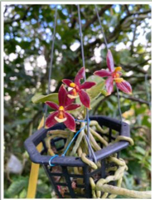
Left: Phal. Cornu cerviRed "RedStar"