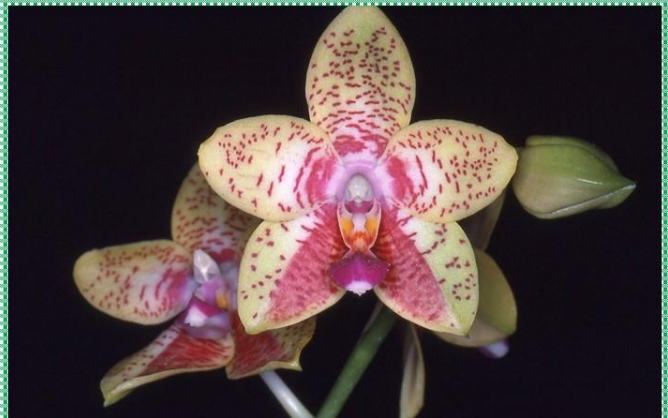
Phal. Orchid World 'S&W' CR HOS

Owners of S&W Nursery 86-524C Halona Road Waianae HI 96792 (808) 696-3864