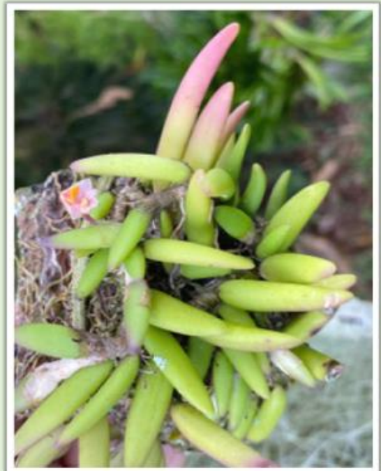
Right: Den. Lichenastru m V. Prenticei