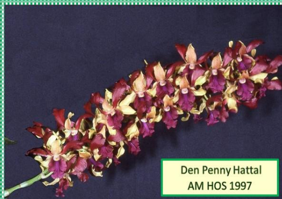
Den Penny Hattal AM HOS 1997