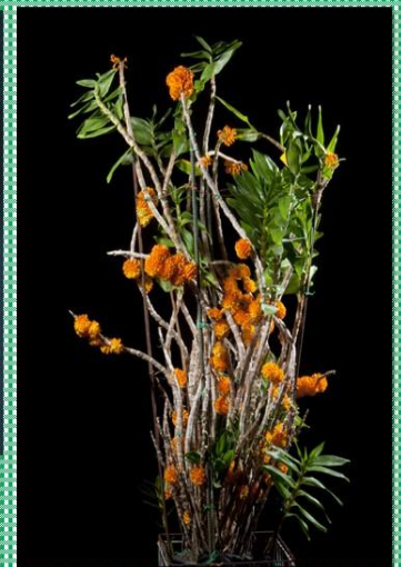
Den Bulleninum 'Penny's Luck' 2018 CCM HOS 4560 flowers & 520 buds on 95 clusters on 26 upright canes