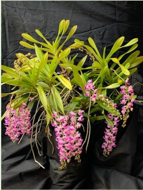
Rhynchostylis coelestis Var. Pink Karen Yamamoto

Received plant from In-laws. Native to Thailand, Cambodia and Vietnam. This plant is tolerant of cool to warm temperatures. Good bloomer with sweet fragrance. This plant was transplanted last year. This is one of eight plants.