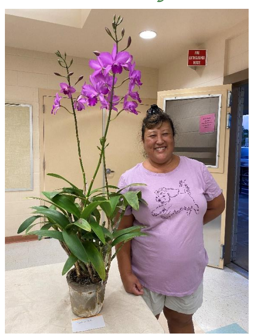
Cattleya Hybrid Janine Mikasa