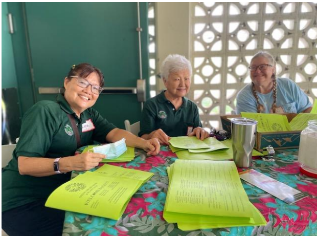
Welcome to the show!