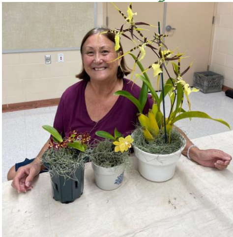
Phal. Cornu-cervi 'Red' x 'Red Star' Dale Mahi