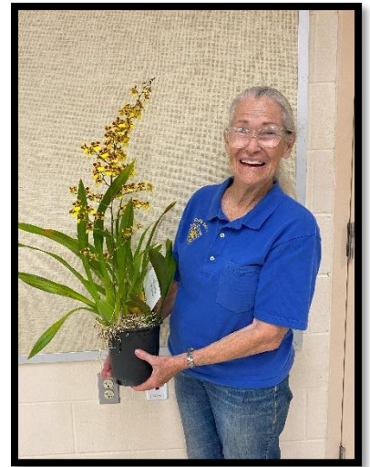
Master Division Oncidium Hybrid Noelle Sutherland