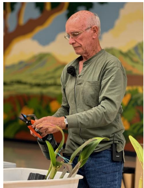
Working from one plant to another, he sterilizes his scissors with the flame of a propane torch.