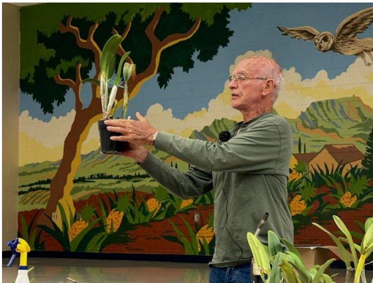
A newly repotted plant, with fresh media and a slightly larger pot, is good for at least another two years of growth.