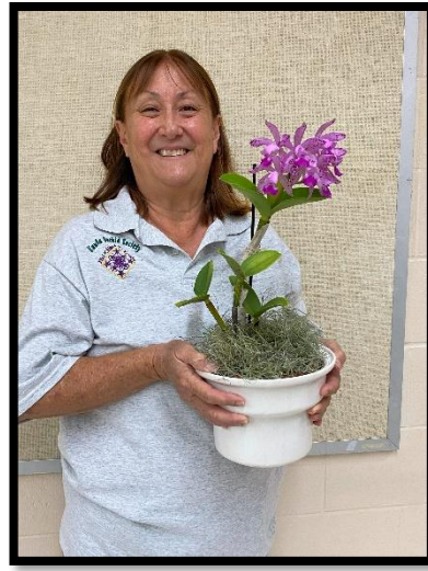
Intermediate Division Cattleya Hybrid Dale Mahi