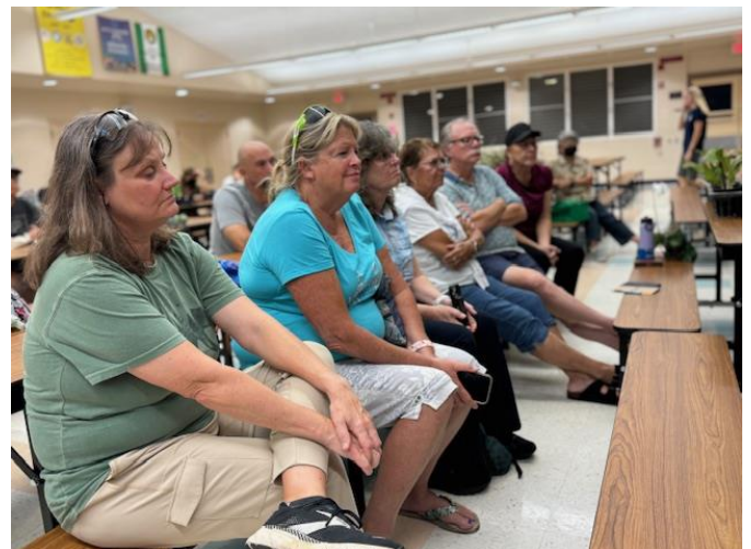
If you really want to see what the speaker is saying and doing, it is good to sit up front.