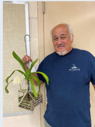
Rhynchostylis Gigantea Max Nonies