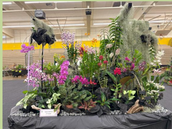
MOS 3 rd Place Table Display