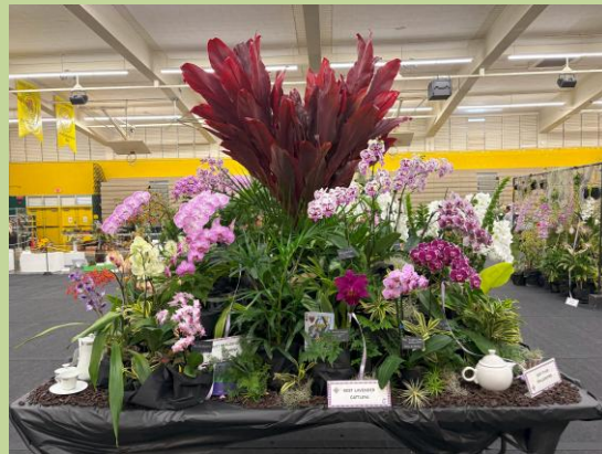
AOS 1 st Place Table Display