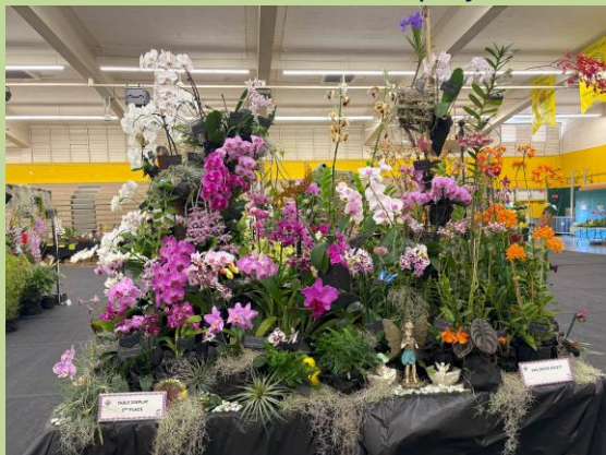
Ewa Orchid Club 2 nd Place Table Display