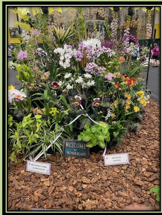
Kunia Orchid Society Display