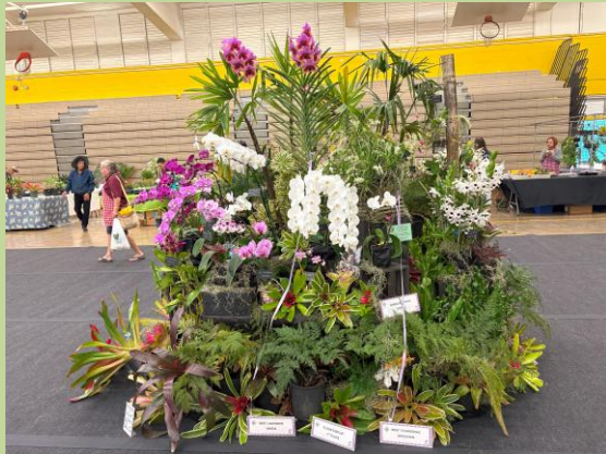
HOS 1 st Place Floor Display

Welcome to the Wonderland of Orchids was the theme of the 67th Kunia Orchid Show and Plant Sale. The event certainly lived up to its reputation as one of the best flowers shows on Oahu! Many thanks to the Honolulu Orchid Society (1st Place Floor Display), the Aiea Orchid Club (1st Place Table Display), the Ewa Orchid Club (2nd Place Table Display), and the Mililani Orchid Society (3rd Place Table display). Their participation gave the public an opportunity to view exceptional blooming specimens, artistically arranged to highlight the eternal beauty of orchids. Judging took place the night before the show and awards were presented to the winners at a ceremony on Friday. Congratulations to Jeremy Domingo for Best in Show , Mel and Pam Waki for Best Flowering Specimen , Calvin Kumano for both Best Cattleya and Best Phalaenopsis in Show and Bernard Cabilao for Best Honohono in Show , also known as the Callman Au Memorial Award. This year KOS was happy to welcome back the addition of an Ikebana display thanks to Mrs. Connie Yoshioka and members of her group. There were many positive comments on the beautiful display of this ancient art form. It was an impressive complement to the floor displays.