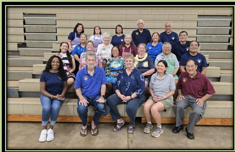
Kunia Orchid Society (Not all members)