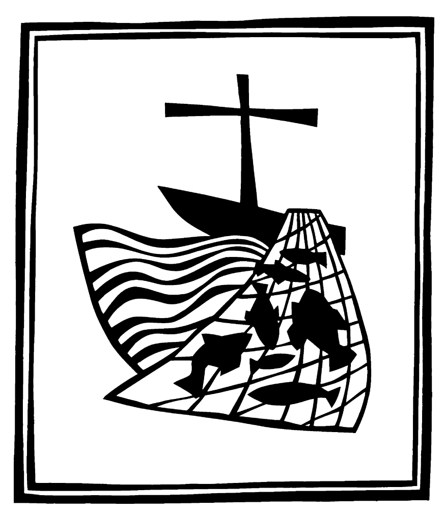
3<sup>rd</sup> Sunday after Epiphany January 24<sup>th</sup>, 2021 9:00am

THAT ALL MAY KNOW THE LOVE OF GOD IN JESUS CHRIST