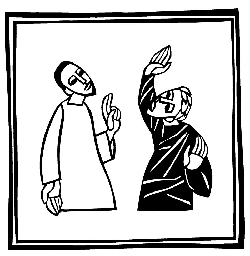
4<sup>th</sup> Sunday after Epiphany January 31<sup>st</sup>, 2021 9:00am

THAT ALL MAY KNOW THE LOVE OF GOD IN JESUS CHRIST