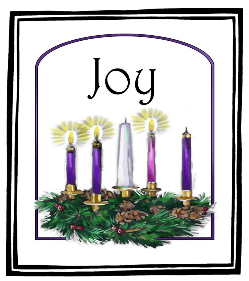
3<sup>rd</sup> Sunday of Advent December 13<sup>th</sup>, 2020 9:00am

THAT ALL MAY KNOW THE LOVE OF GOD IN JESUS CHRIST