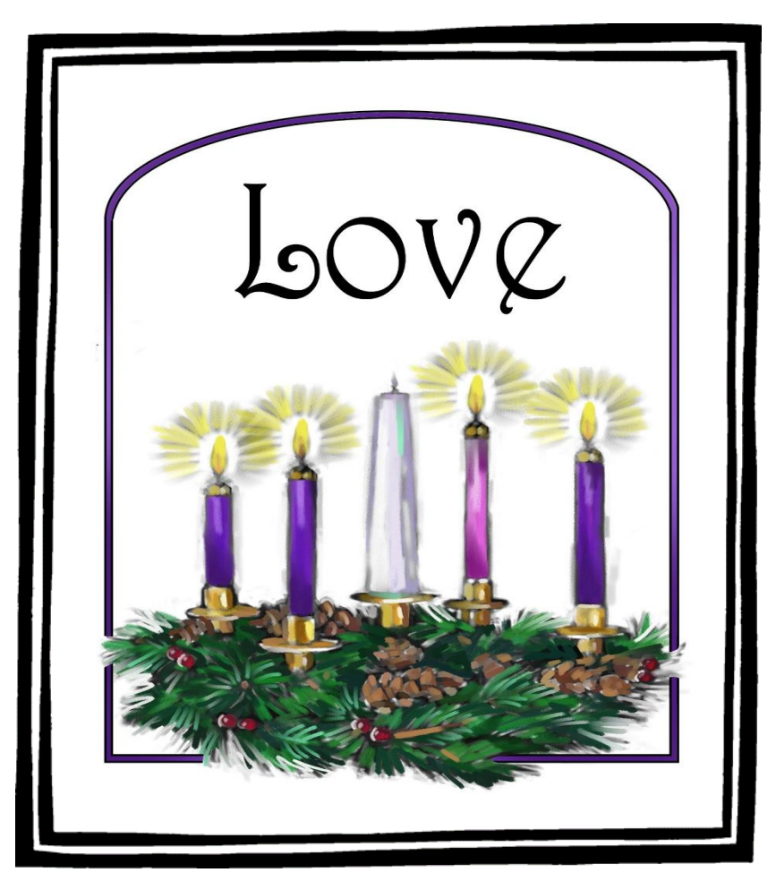
4<sup>th</sup> Sunday of Advent December 20<sup>th</sup>, 2020 9:00am

THAT ALL MAY KNOW THE LOVE OF GOD IN JESUS CHRIST