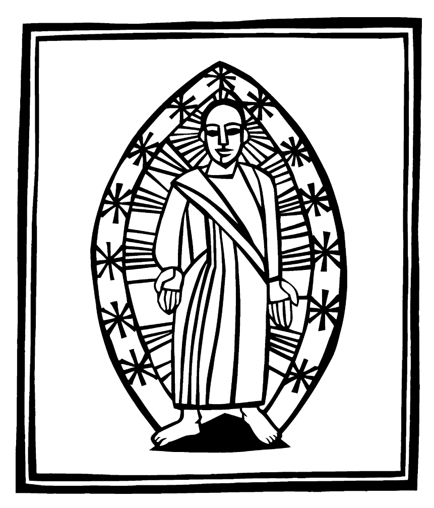
6<sup>th</sup> Sunday after Epiphany February 14<sup>th</sup>, 2021 9:00am

THAT ALL MAY KNOW THE LOVE OF GOD IN JESUS CHRIST